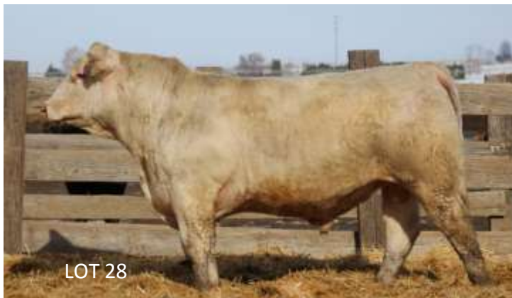
This Moderate framed thick made calving ease Assertion son will catch your eye in the pen. He is very correct free moving.