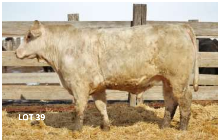
Moderate birth weight, long and very smooth 20 month old bull. This bull is correct and put together the right way!

Sire: M707559 LT SILVER DISTANCE 5342P M775589 EC SILVER DISTANCE 740 PLD F1073105 GC 4L MS WINDS EDGE 740 P M803623 EC SILVER DISTANCE 948 PLD M686569 LT BLUEGRASS 4017 P F1106477 EC BLUE MOON 948 PLD F1025893 EC MISS ASSERTION 53 P M694179 VVCR WHITEHOT PRESTIGE M778144 CR COWBOY 999 PLD F857422 CHEWACK SHURRTOP COWGIRL Dam: F1144919 CR DOUBLE HOTTIE 193 PLD M694179 VVCR WHITEHOT PRESTIGE F1110518 CR HOTTIE MAC 542 PLD F924045 CR MISS APRIL MAC PLD