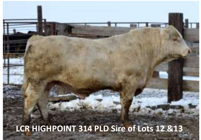
LCR HIGHPOINT 314 PLD Sire of Lots 12 & 13

Sire: M838590 LCR ROYAL TRADITION 125 PLD M633377 M6 GRID MAKER 104 PET M685500 EC NO DOUBT 2022 P F956614 EC LADY DUKE 2022 P M726505 EATONS ROYAL DYNASTY 6164 F1130314 CR MS REGAL DYNASTY 125 PLD F1059953 CR MISS PARTNER 420 PLD M411450 LT WYOMING WIND 4020 PLD M797960 CR COWBOY WIND 999B PLD F857422 CHEWACK SHURRTOP COWGIRL Dam: F1195791 LCR MS RAMEY WIND 386 PLD M476538 UI PARTNER 842 F992814 CR MISS RAMSEY 315 PLD F857427 CHEWACK MISS MAC 800