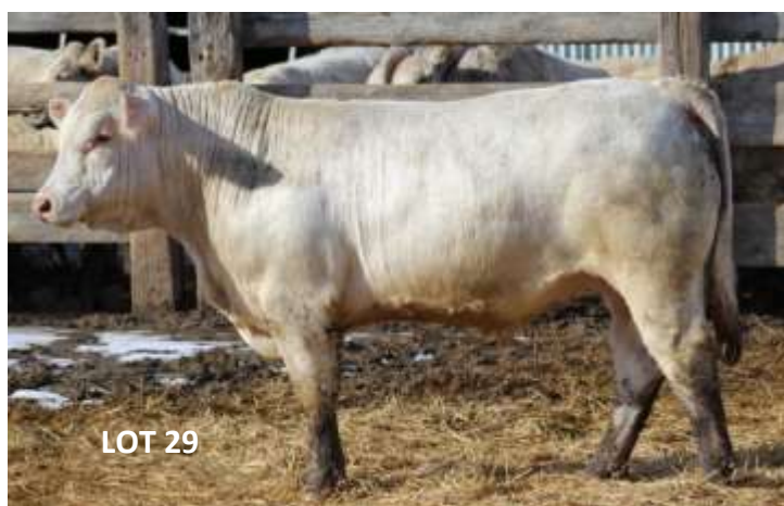
Moderate framed, extra calving ease and a large scrotal. He is the last calf out of a very productive 14 year old dam. You'll sleep easy at night with his calves. Top 15% for BWT and 20% for CE EPD.