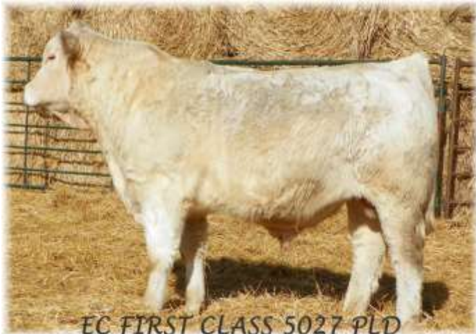
EC FIRST CLASS 5027 PLD