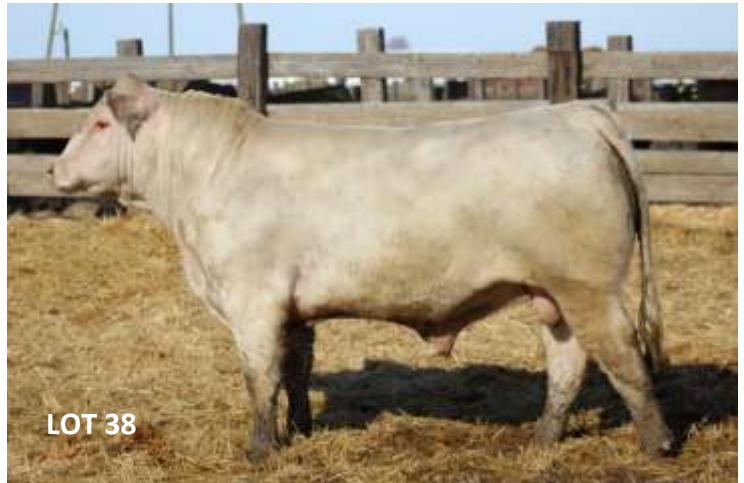
A stylish very smooth made calving ease bull with a great birth to weaning spread. Gaining over 4 pounds a day with a large scrotal.

Sire: M707559 LT SILVER DISTANCE 5342P M775589 EC SILVER DISTANCE 740 PLD F1073105 GC 4L MS WINDS EDGE 740 P M803623 EC SILVER DISTANCE 948 PLD M686569 LT BLUEGRASS 4017 P F1106477 EC BLUE MOON 948 PLD F1025893 EC MISS ASSERTION 53 P M778143 CR MAC N JACK 403 PLD M797328 CR PRIME MAC 526 PLD F1130022 CR MISS PRIME PARTY 526 P Dam: F1137378 ROSIES WYOMING TULIP M694179 VVCR WHITEHOT PRESTIGE F1133079 CR WYOMING WILD ROSE 748 F1130227 CR MS MAC WIND 421 P