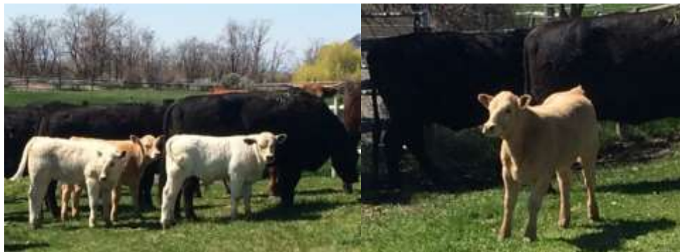
Lundgren Charolais sired commercial calves, from a happy customer in Eagle, ID