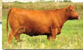
FEDDES LAKINA 310, dam