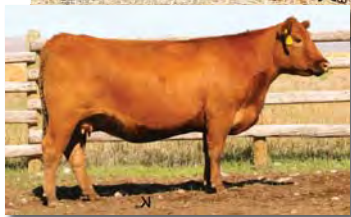
FRI A47, dam