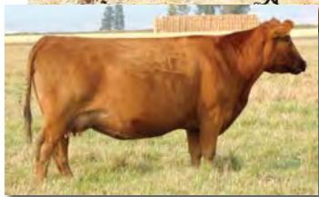
FEDDES BLOCKANA 87S, paternal granddam