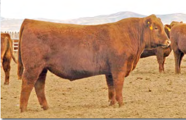
FEDDES CONQUEST Y34