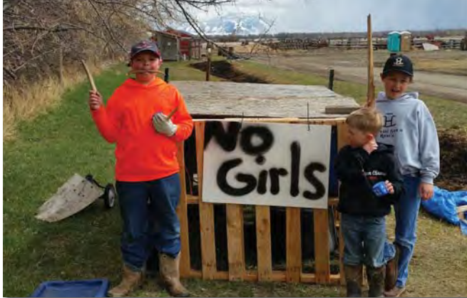
Absolutely NO GIRLS allowed, except grandma if she has cookies!