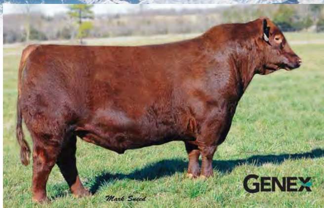
BROWN JYJ REDEMPTION Y1334