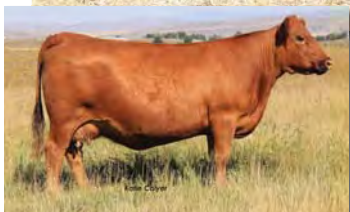
C-T MISS PAN 0760, dam