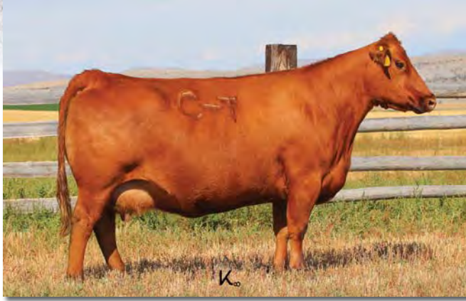
C-T LARKABA 0733, dam