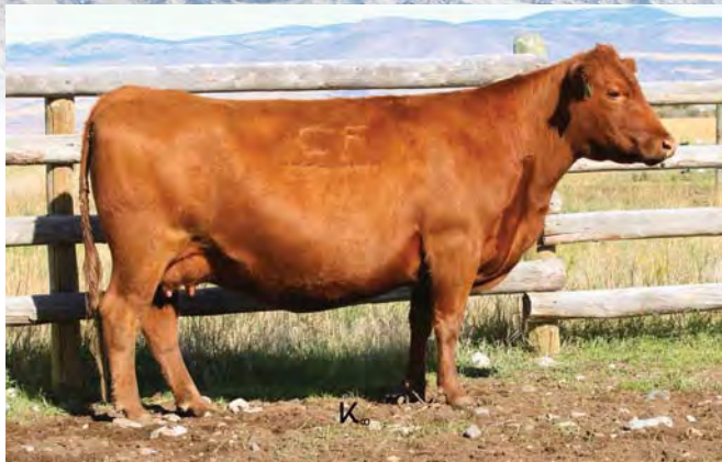
FEDDES HILARY Y26, dam