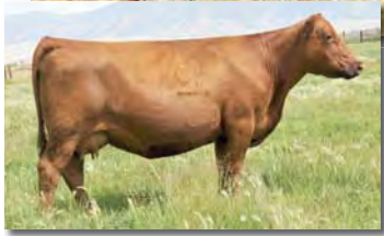
FEDDES BLOCKANA R64, maternal granddam