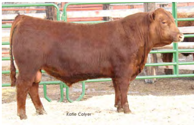
FEDDES SILVER BOW B226

One of our high selling and performing Duke sons, Selling to Leland Red Angus. Siring consistent length and growth from a powerful Blockana Make Mimi cow.