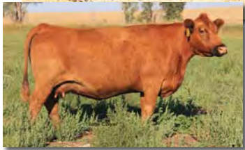
FEDDES SLEEK 2S, maternal granddam