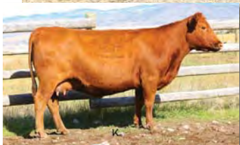
FEDDES LAKINA Y17, paternal granddam