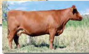
C-T BLOCKANA 1042. dam