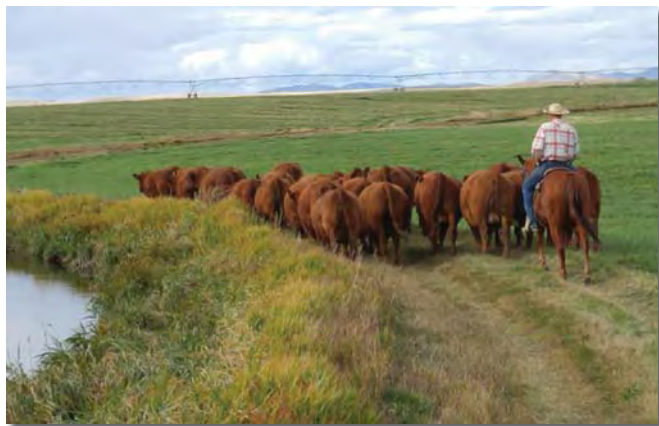
Out to grass