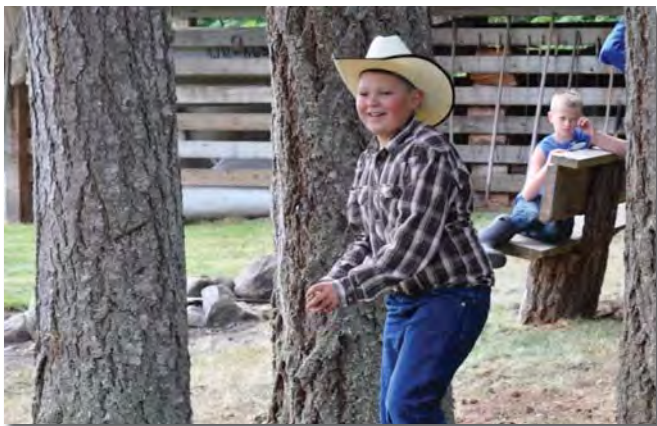
Cordon, a cowboy at heart!