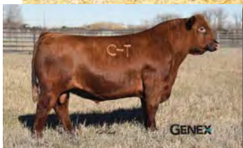
C-T RED ROCK 5033, paternal sibling