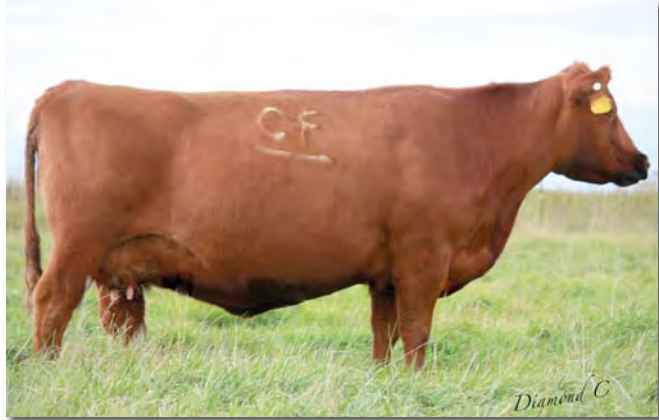
FEDDES LASS 7150, dam