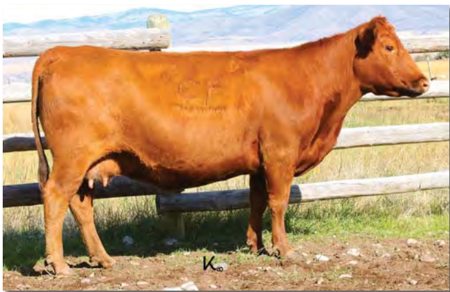
FEDDES LAKINA Y17, dam