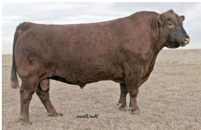
BIEBER MAKE MIMI 7249