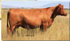
GMRA ANGIE ROSE 944, dam