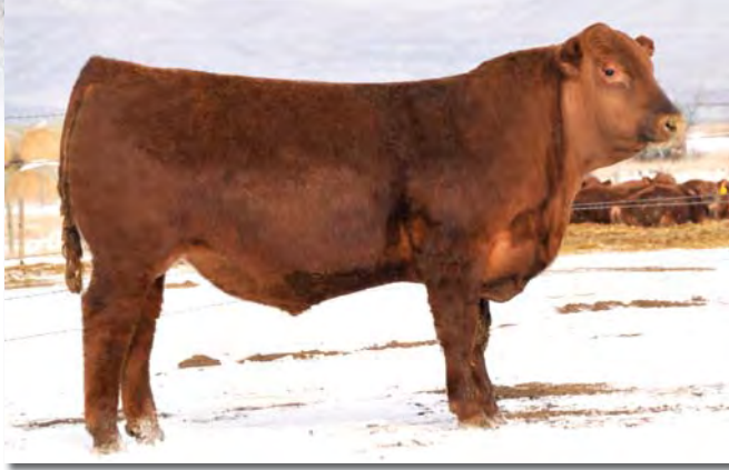
C-T GRAND DESIGN 3023