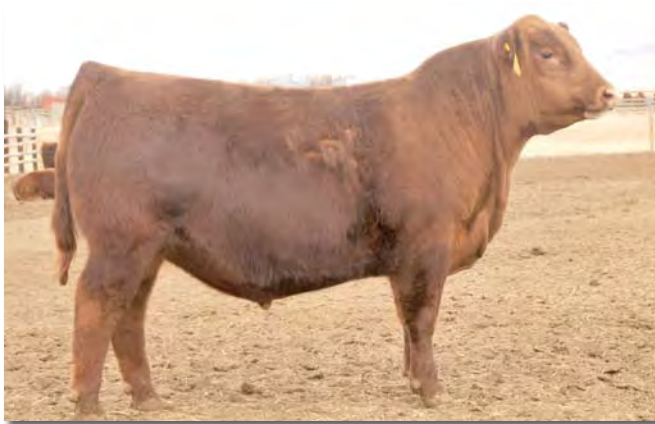
C-T THE QUEST 1103

A great young sire from Genex. He is siring some great maternal and calving-ease traits with an outcross pedigree. Don't miss this exciting new sire group.