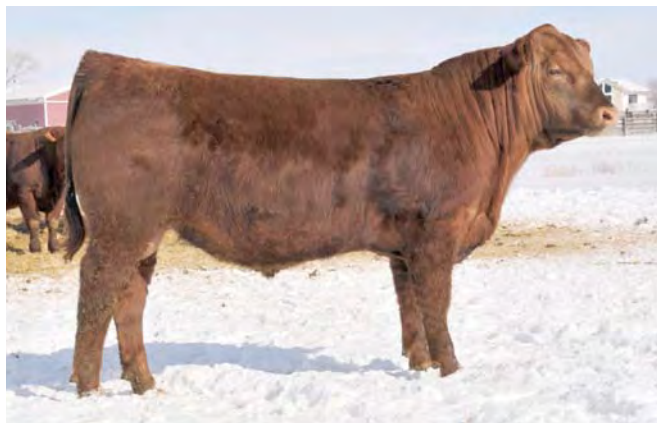
FEDDES CONRAD A208