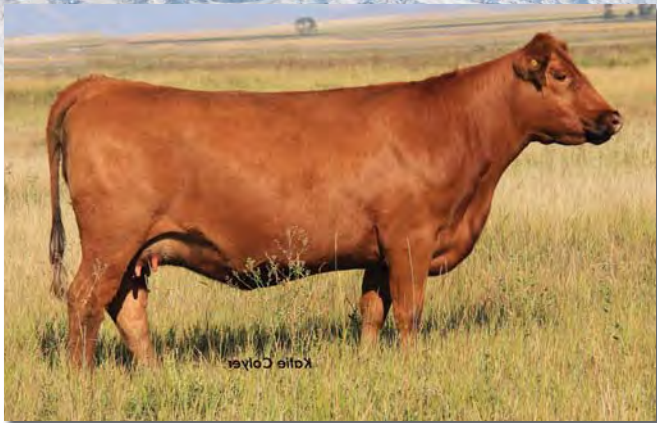
C-T CHRIS 2061, dam