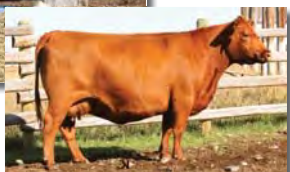
FEDDES BLOCKANA 825, dam