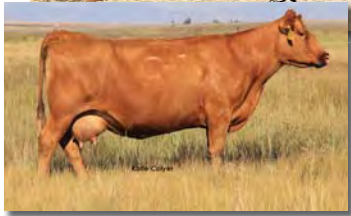
C-T VERDI 4017, maternal granddam