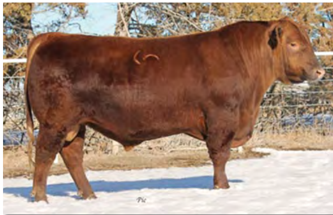
LSF SAGA 1040Y