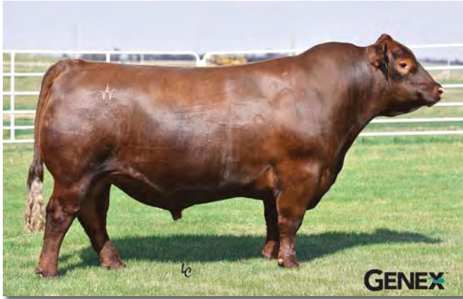
ANDRAS NEW DIRECTION R240

High-selling bull to Bauman Red Angus in 2014. Very consistent calving-ease bull with extra length and growth. Will leave behind a great set of females.