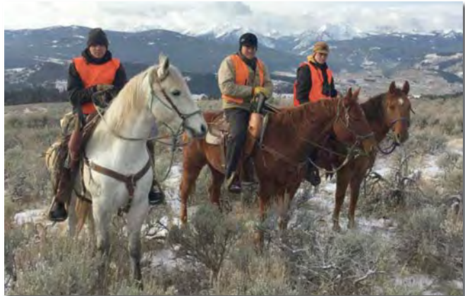
DeBoer Boys Hunting