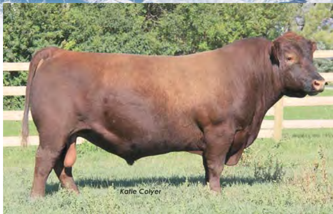
FEDDES MONTANA X44