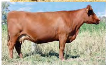
C-T BLOCKANA 1042, dam