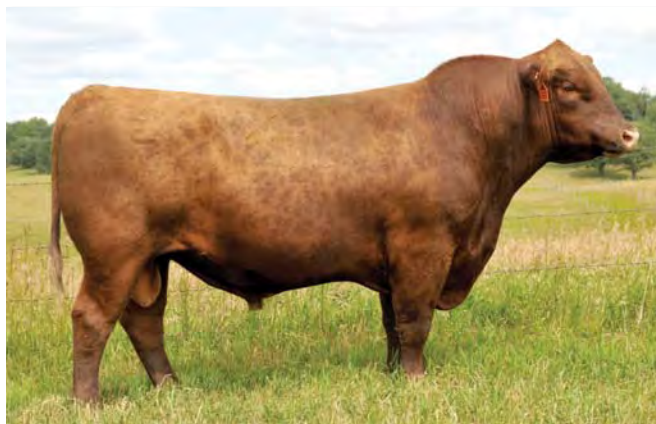
5L INDEPENDENCE 560-298Y

Feddes Silver Bow B226 was our high selling bull in 2015 to VF, Meyer family farm, Pitchfork T and Dunn's Double Eagle. His first calf crop has excelled in every herd. His sons have worked their way to the top of this sale offering. His dam is our highest MPPA cow in our herd at 111 on 4 calves. His EPDs just keep getting better. He is a true big spread bull.