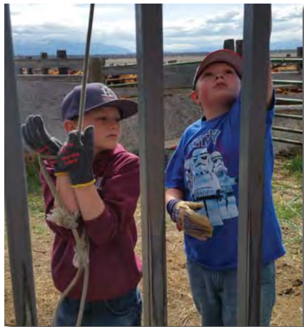
Cousins working together!