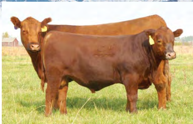
FEDDES LASS 7150 with her 2012 calf