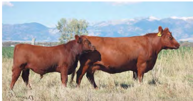
C-T VERDI 0807, dam