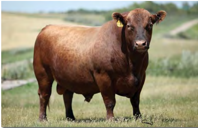
FEDDES CASCADE Z157

High performing Conquest son selling to 5L Red Angus, who has gone on to leave behind not only great bulls but also some breed leading cows. He makes them moderate with extra volume and muscle all in an attractive package