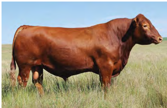
C-T ROYAL DUKE 4090

He is a great calving ease sire from Genex that is siring some very consistent calves. He comes to the top in many traits, which we are seeing in his offspring.