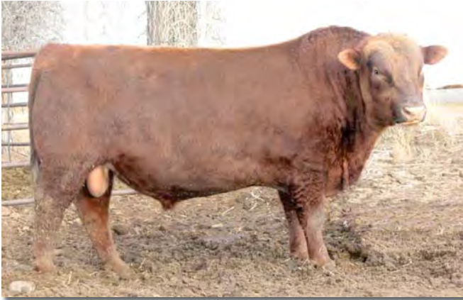
5L ADVANTAGE 3267-221Y

Feddes Conquest Y34 sold to Sandy Willow Red Angus. We have used him for several years. He calves easily, without really small calves, yet they grow out really well. We have some really good young daughters.