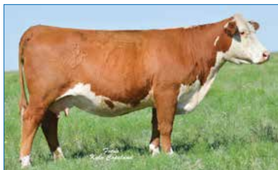
JCS PRECIOUS 0285 | Dam of Lots 36 & 37