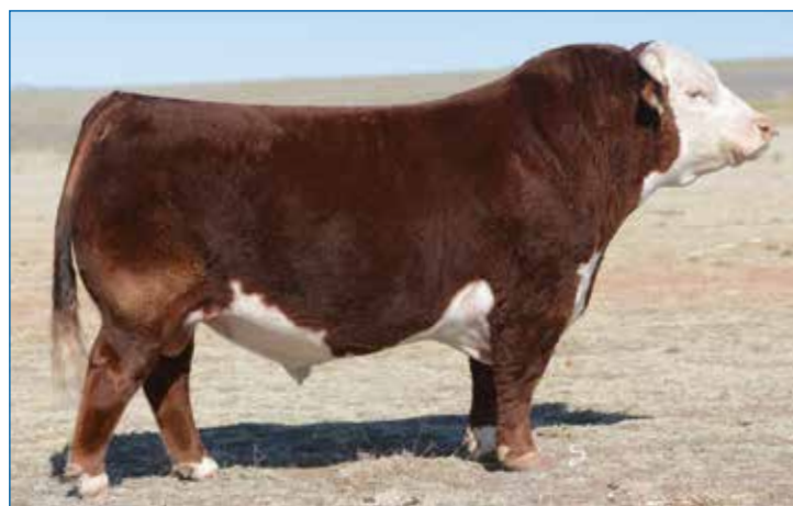
JCS HOMEBREW 4616 | Sire of Lots 17 & 18