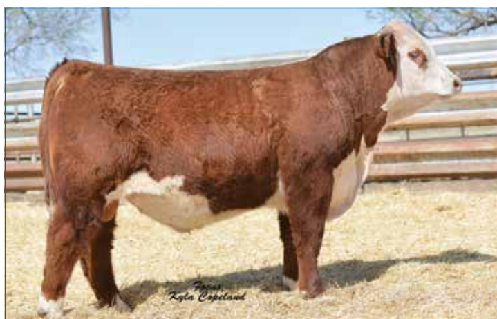
JCS 240 FLINTLOCK 5815 | Maternal Brother to Lot 15