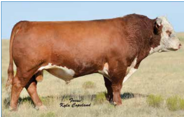
BAR S LHF 028 240 | Maternal Grand Sire of Lot 22