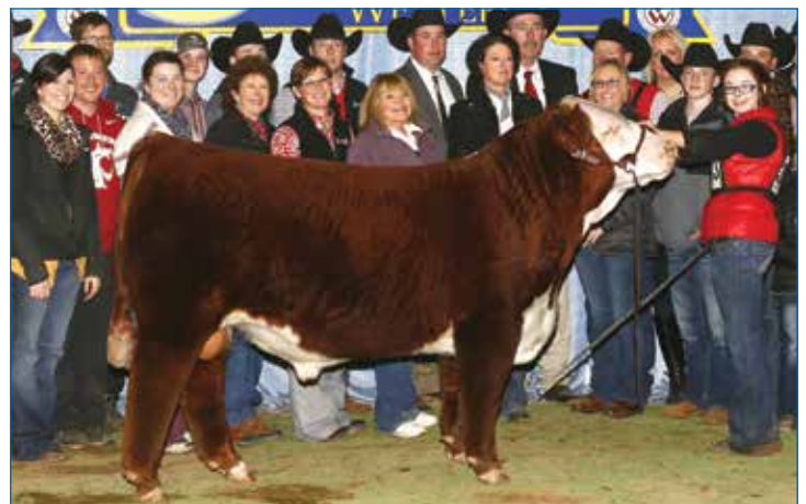
BR BELLE AIR 6011 | Son of Lot 1 | 2017 NWSS Grand Champion Bull