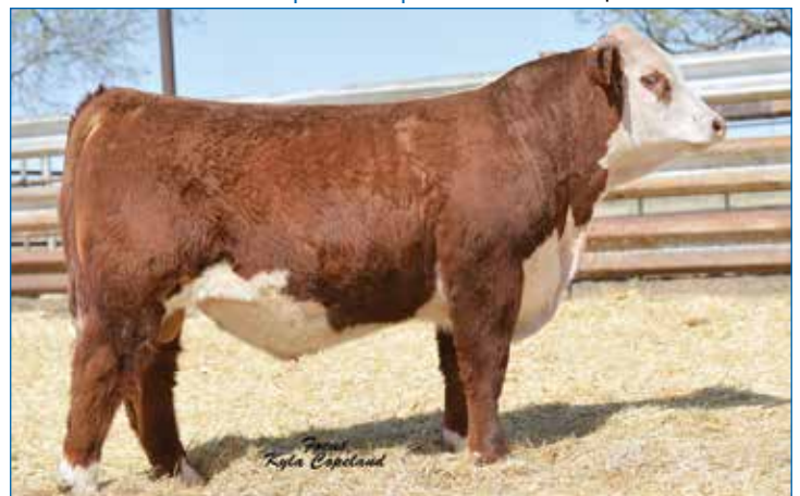
JCS 240 FLINTLOCK 5815 | Son of Lot 1 | a Top Seller in our 2016 Sale