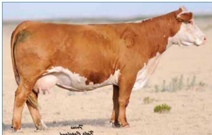
JCS MISS ROYALTY 4720 | Dam of Lot 20