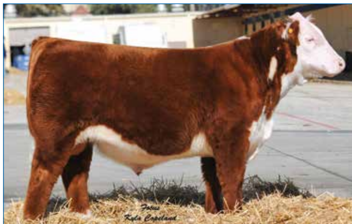
LANGFORDS 2205 ET | Sire of Lots 33-38 and 44-47