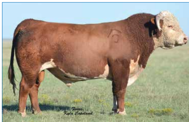
JCS 4743 RAM 0310 | Sire of Lots 48-50