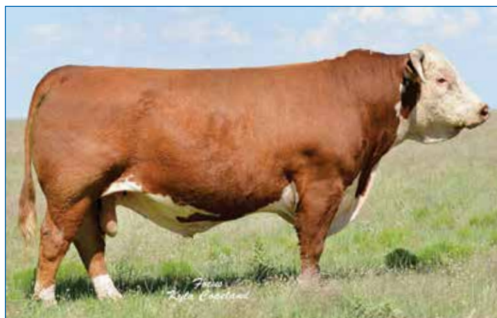
BR COPPER 124Y | Sire of Lots 11-14