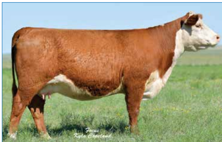
JCS MISS KITTY 2418 | Dam of Lot 19