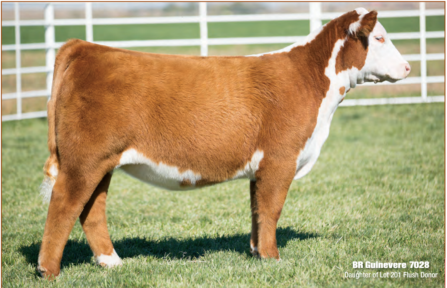
BR Guinevere 7028 Daughter of Lot 201 Flush Donor

Dam of this top selling female in our 2017 Holiday Lights Sale!