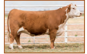
BR CSF Breezy 1076 ET – dam of Lot 110 – sells as Lot 136