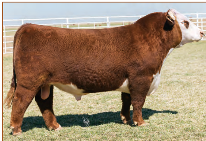
BR Belle Air 6011 – son of Lot 1 $600,000-valued full brother to Lot 1A & maternal brother to Lots 1B–1F