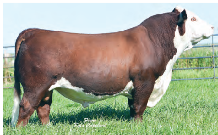
CRR 719 Catapult 109 – sire of Lot 219B embryo