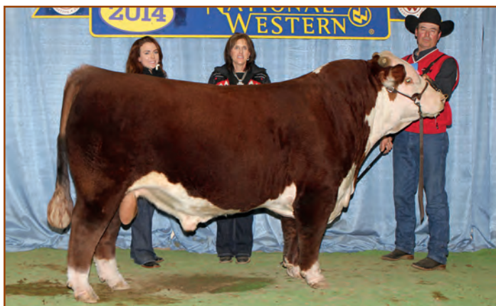
UPS Sensation 2296 ET – sire of Lots 209, 210 & 218 embryos