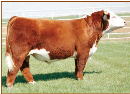
BR Sooner On Sooner – son of Lot 101