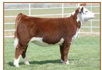
Daughter of Lot 3