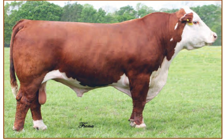
BR Moler ET – sire of Lots 132 & 133