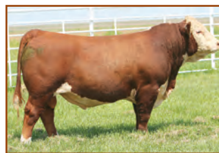
Son of Lot 3