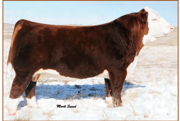
CRR About Time 743 – sire of Lot 95