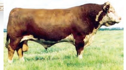
Remitall Keynote 20X – influential AI sire

Gabrielle) in his first calf crop. 6052 won many national shows and was also the dam of multiple national champions as well.