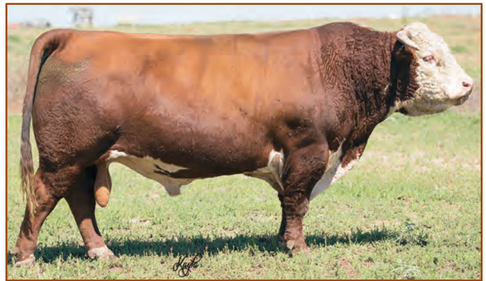
BR RA Copper 128Y – son of Lot 4