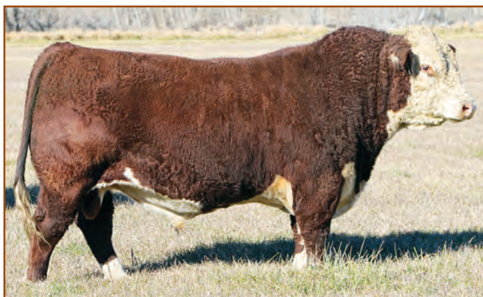
NJW 135U 10Y Hometown 27A – sire of Lot 216 embryos