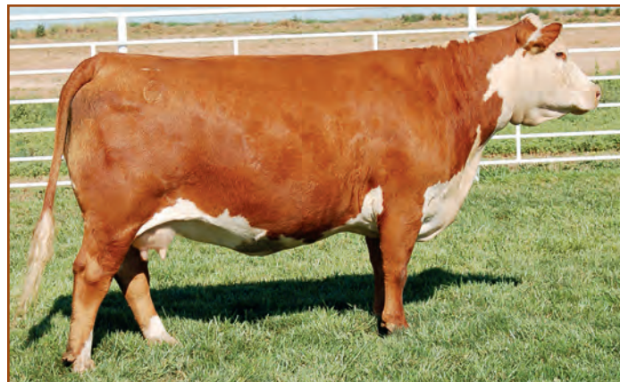
BR CSF Gabrielle 8051 ET – dam of Lots 218 & 219 embryos