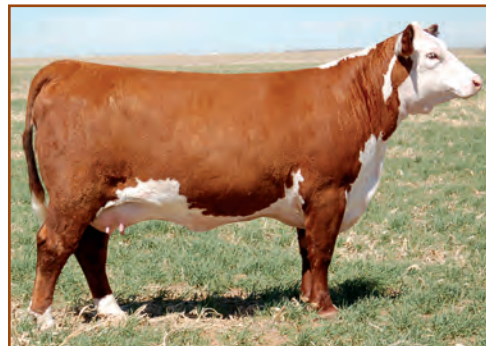
BR Anastasia 3023 ET – dam of Lots 5–9