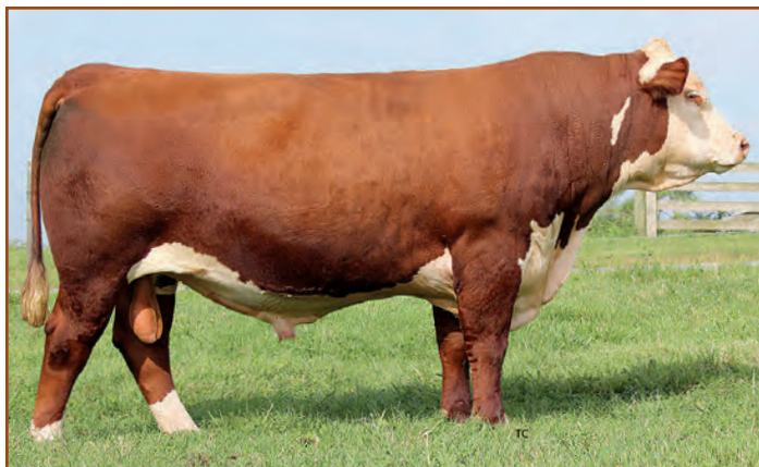
KCF Bennett Encore Z311 ET – sire of Lot 217 embryos