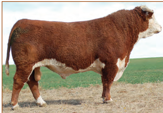
BR Lansing 3060 – sire of Lots 129–131