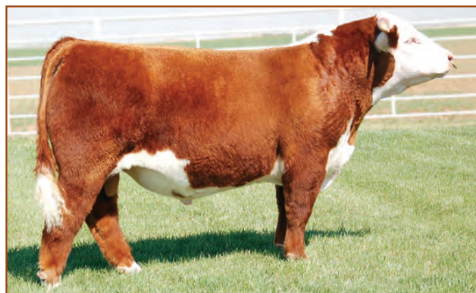
BR Sooner On Sooner ET – full sib to Lot 212 embryos – maternal sib to Lot 211