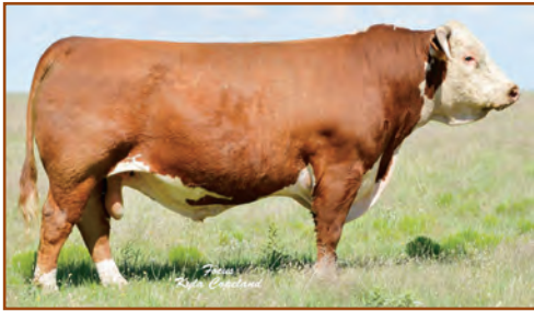
BR Copper 124Y – sire of Lots 1B, 1C, 1E & 1F – his dam sells as Lot 2