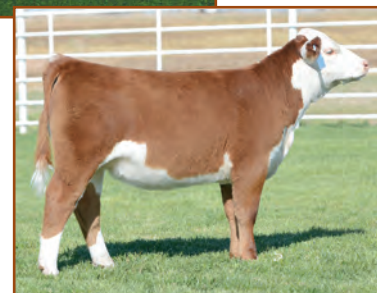
Daughter of Lot 136

Pictured in 2012 as Reserve Grand Champion Female at the Fort Worth Stock Show