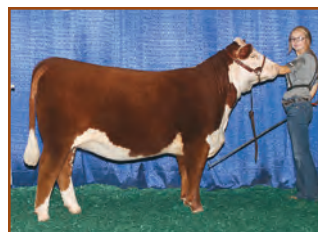
BR Red Pepper 6632 ET – 2017 JNHE Division Champion & Champion Owned Heifer at the 2017 Texas State Show