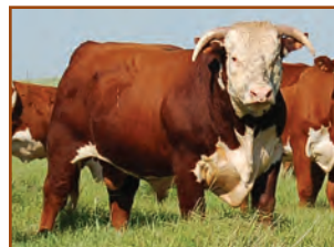
BR CSF Copper ET