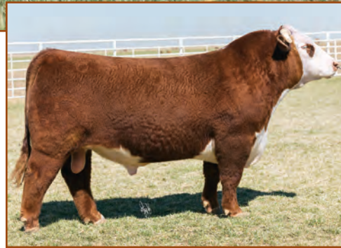
BR Belle Air 6011 – sire of Lot 5