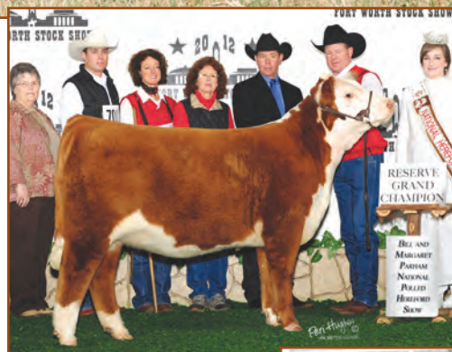
BR CSF Breezy 1076 ET – Lot 136

Pictured in 2012 as Reserve Grand Champion Female at the Fort Worth Stock Show