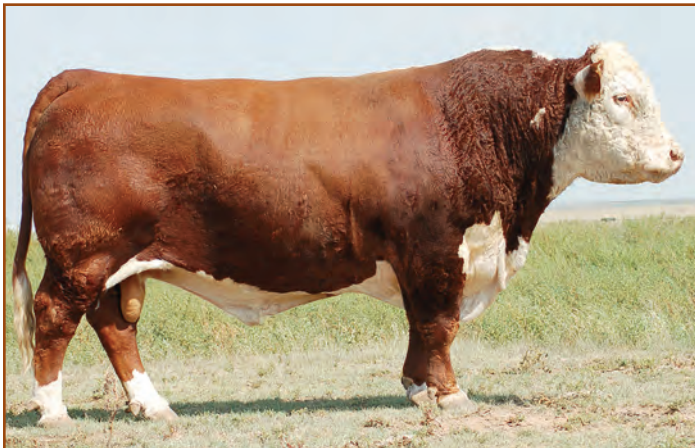
DM BR Sooner – several daughters & granddaughters sell