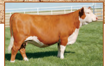
BR Audrey 4075 ET – two-time Reserve National Champion