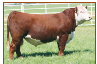
Son of Lot 3

“We don’t care if they are horned or polled, but we do care if they have a lot of maternal ability bred into them and great udders.”