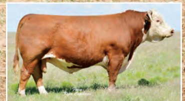
BR Copper 124Y – son of Lot 2