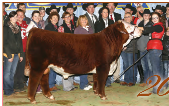
BR Belle Air 6011