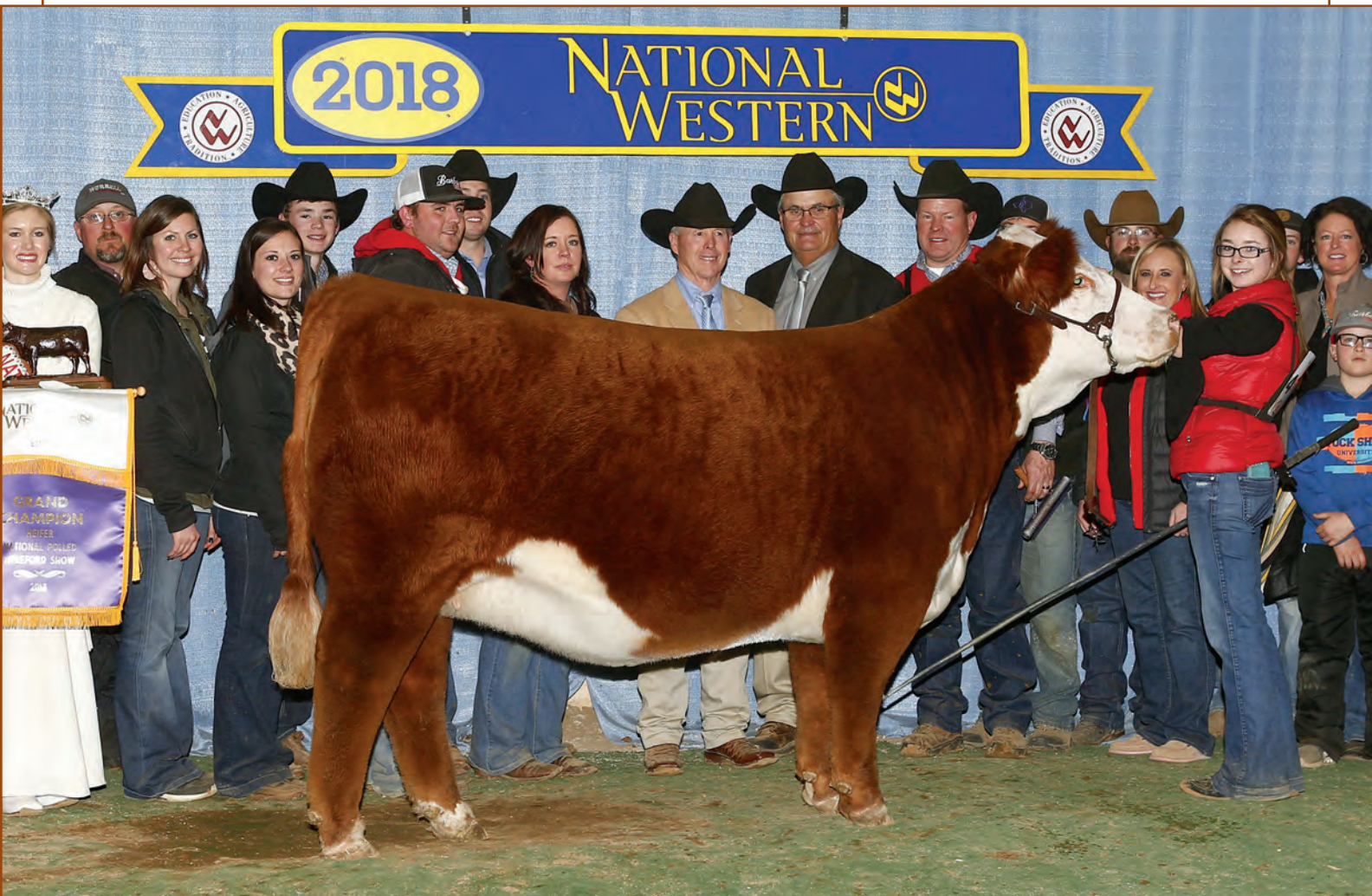
BR Amber 6089 – daughter of Lot 61