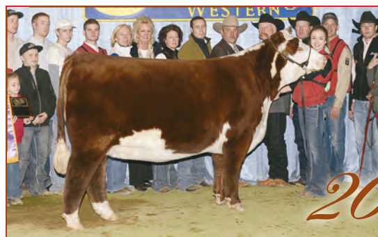
BR Anastasia 3023 ET