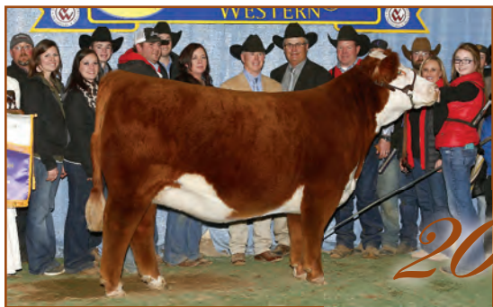
BR Amber 6089