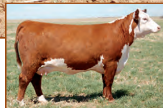
BR Anastasia 3023 ET – six-time National Champion