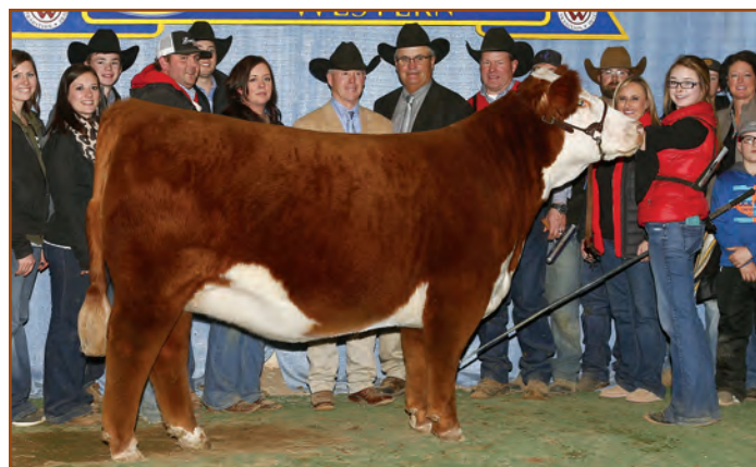
BR Amber 6089 – full sib to Lot 213 embryos