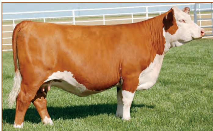
BR Audrey 4075 ET – dam of Lots 208 & 209 embryos