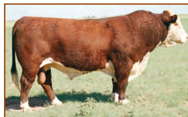
BR Bentley 0034 ET – sire of Lot 34