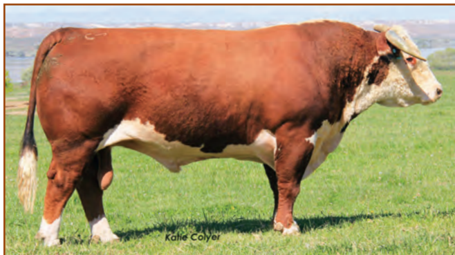
BR Golden Spread Dan – bis daughters sell