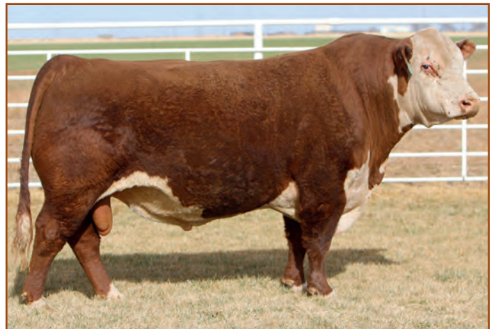
BR Hutton 4030ET – sire of Lots 20 & 21 His semen sells Friday night!