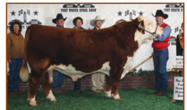
BR Currency 8144 ET

Two of Barber Ranch's most influential herd sires, Copper & Currency are full brothers to Lots 2–4.