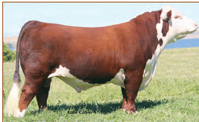
CRR 5280 – sire of Lots 219A & 220 embryos