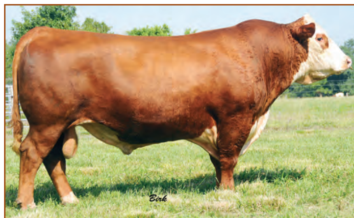
Boyd Worldwide 9050 ET – sire of Lot 221 embryos