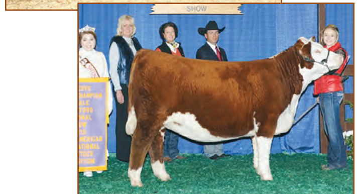
BR Audrey 4075 ET – dam of Lot 10