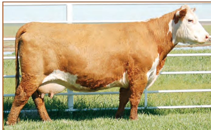
BR Ms Sooner 7172 – dam of Lots 211 & 212 embryos