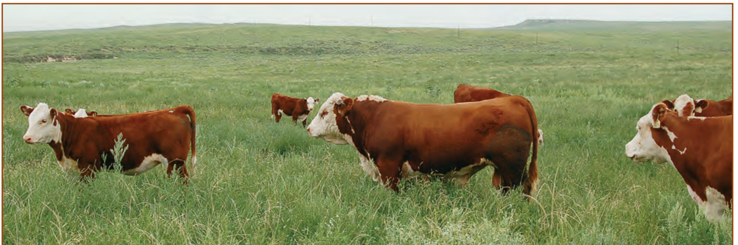
Herd sire pictured below is BR Bold Gold 4012 ET...