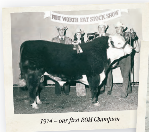
1974 – our first ROM Champion