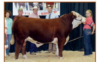
BR RCR McKavett 5509 ET – 2016 JNHE Grand Champion Bull