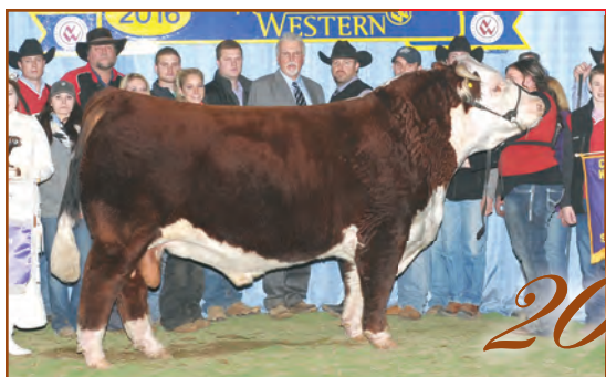
BR Nitro Aventus 3116 ET