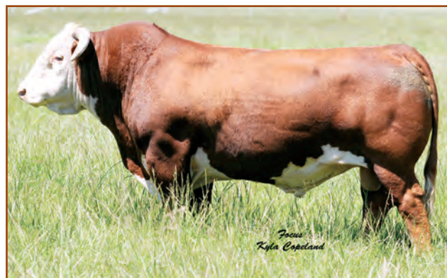
BR DM TNT 7010 ET – bis daughters sell