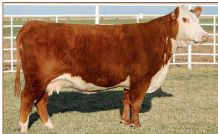
BR Bryanna 3008 – dam of Lot 214 embryos – sells as Lot 38