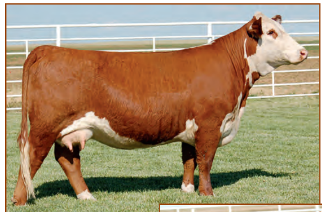
BR Veronica 5019 – daughter of Lot 99

99A Heifer calf born 1/6/18, tattoo 8010, by BR Catapult 5520 ET. BW 65 lbs.