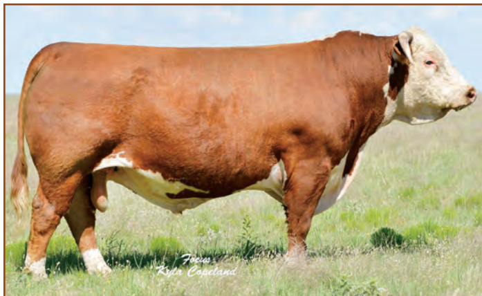
BR Copper 124Y – sire of Lot 215 embryos