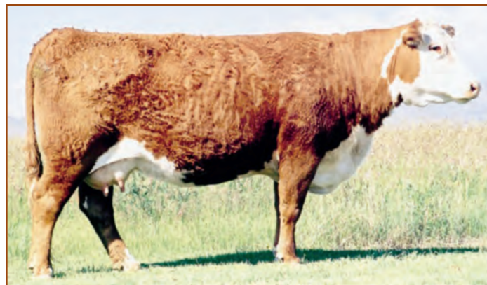
CL 1 Dominet 496 1ET – granddam of Lots 145 & 146 – other descendants sell