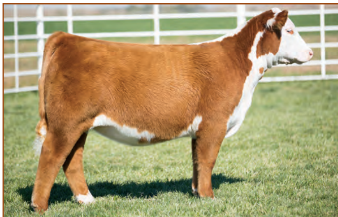
BR Guinevere 7028 – maternal sister to Lot 210 embryos