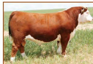
BR Nitro Aventus 3116 ET – three-time National Champion & Denver Supreme Champion