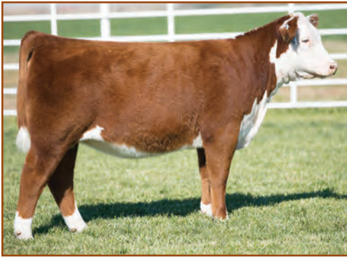
$13,750 daughter of Lot 103