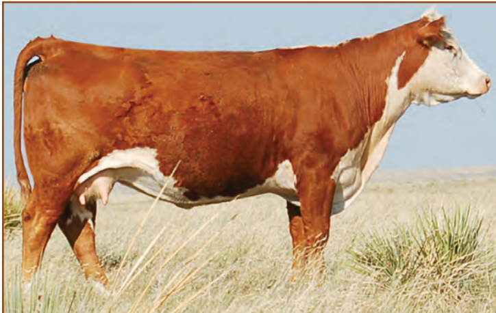
BR Secret Destry 8055 – dam of Lot 46