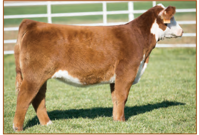
BR Raelynn E055 ET – daughter of Lot 96