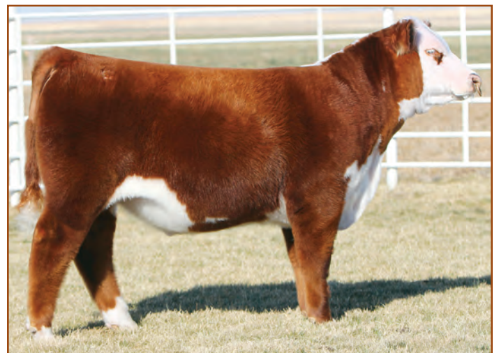
BR Compton E040 ET – son of Lot 1 $94,000-valued full brother to Lot 1A & maternal brother to Lots 1B–1F