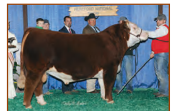
RJ AMC Big Chief 6033 ET – 2017 NAILE Grand Champion Bull – raised by Rafter J Cattle

In addition to these six pictured, five other progeny of 8130 have captured division championships at national shows.