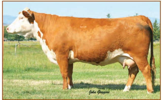
CL 1 Dominette 095K – dam of Lot 59