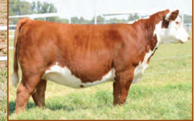
$60,000 daughter of Lot 100 sold by Express Ranches