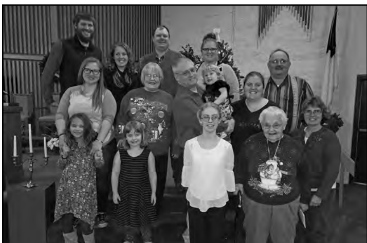
Sonderup Charolais Ranch, Inc.

Growth *** Fleshing Ability ** Muscle Dimension ***