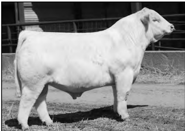
SCR Casanova 7107 (Reference Sire D)

Growth **** Fleshing Ability **** Muscle Dimension *****