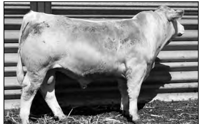
SCR Stoneridge 3171 (Reference Sire E)

Growth **** Fleshing Ability **** Muscle Dimension ****