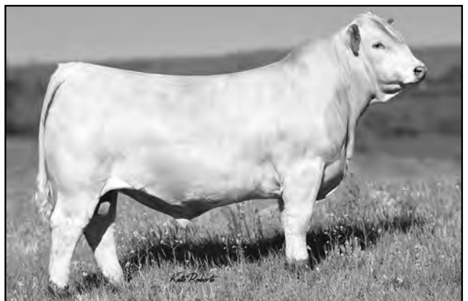
LT Affinity 6221 Pld (Reference Sire C)

Growth *** Fleshing Ability *** Muscle Dimension *****