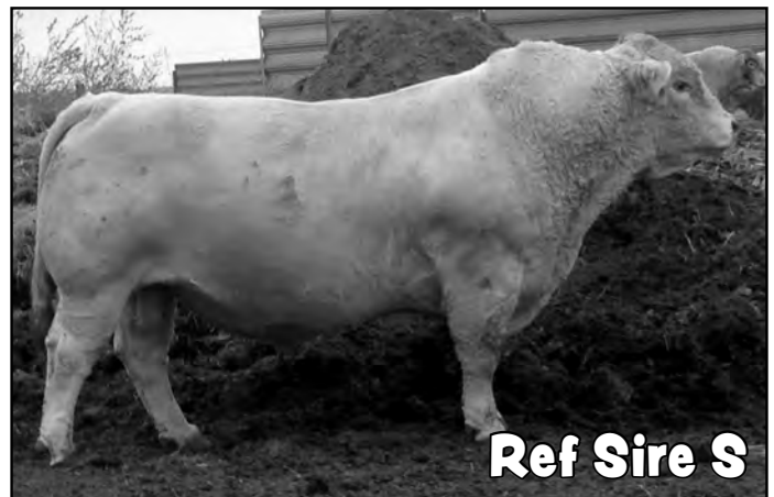
Ref Sire S