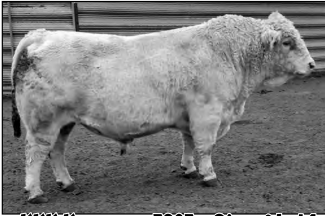
KKK Kasanova 7307 - Sire of Lot 1