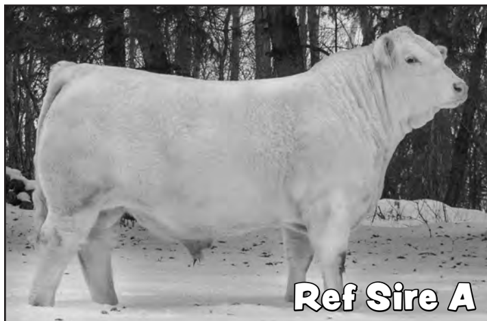
Ref Sire A