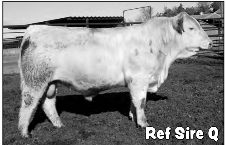
Ref Sire Q