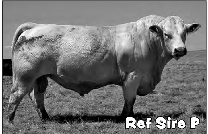
Ref Sire P