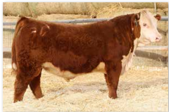
NJW 84B 10W JOURNEY 53D - Sire of Lot 21