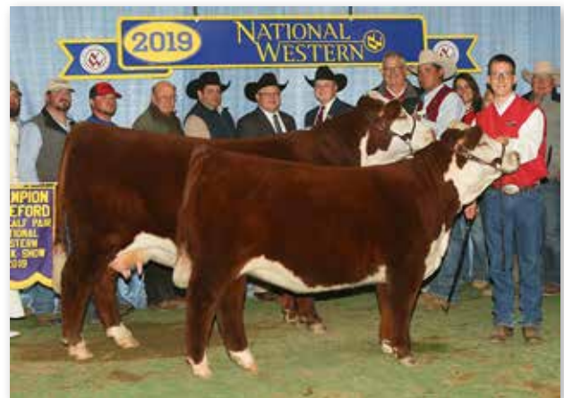
PCC NEW MEXICO LADY 6002 ET - Dam of Lot 10