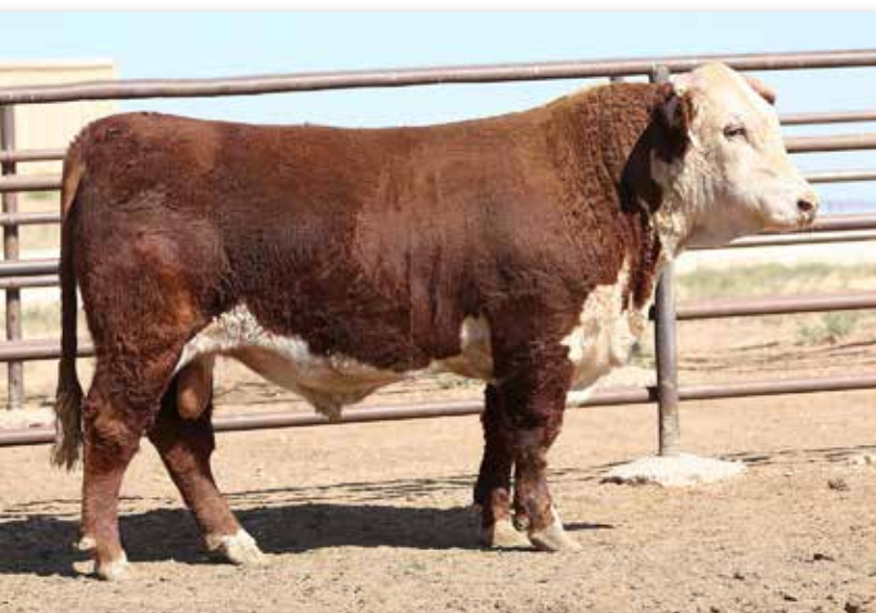
Lot 15 — PCC BAR S LHF MR 725 969