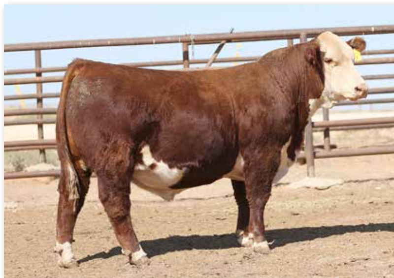
Lot 6 — PCC 4006 6105 RIBEYE 9169 ET