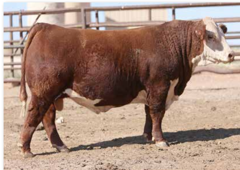
Lot 7 — PCC 5063 8Y HOMEGROWN 9176 ET