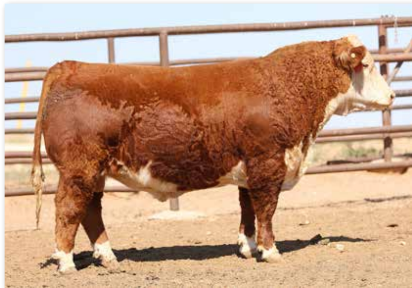
Lot 2 — PCC 6036 134E PARTNER 9219 ET