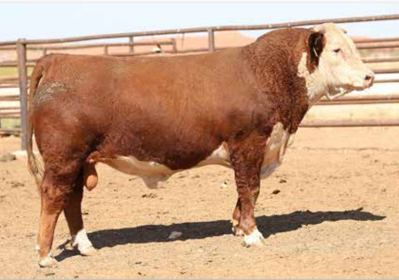
Lot 9 — PCC BAR S MR 725 9101