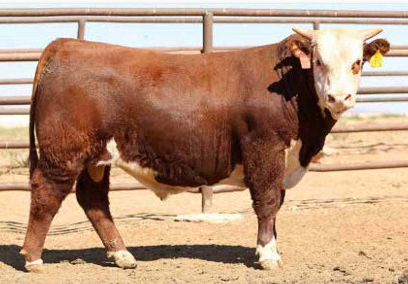
Lot 28 — PCC 4003 4036 LINCOLN 9213