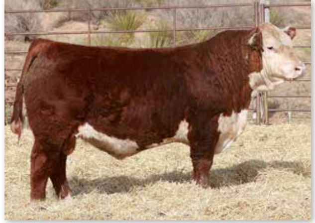
PCC 36A RIBEYE 6105 ET - Sire of Lots 1, 3 and 6