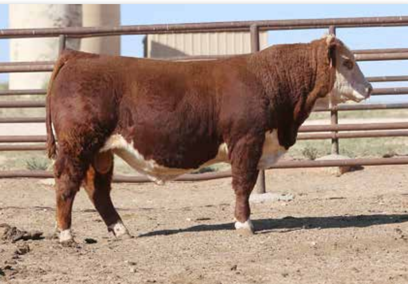
Lot 27 — PCC 5050 4036 LINCOLN 9212