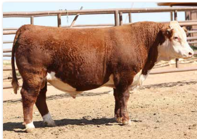
Lot 8 — PCC 3055 49C MIGHTY 9183 ET