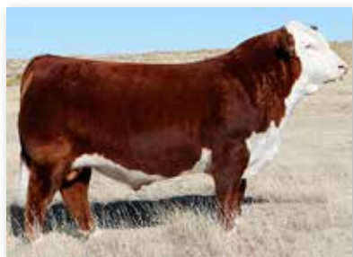
NJW 79Z 22Z MIGHTY 49C ET Sire of Lots 8, 10 and 30

• Level designed attractive bull that's up headed.