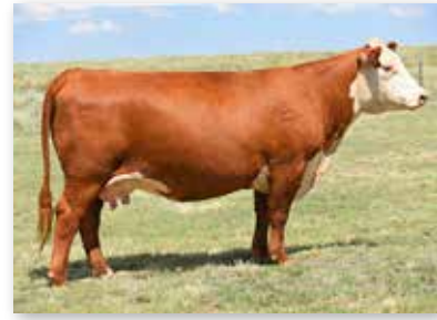
KTP NEW MEXICO LADY 2025 Dam of Lot 13