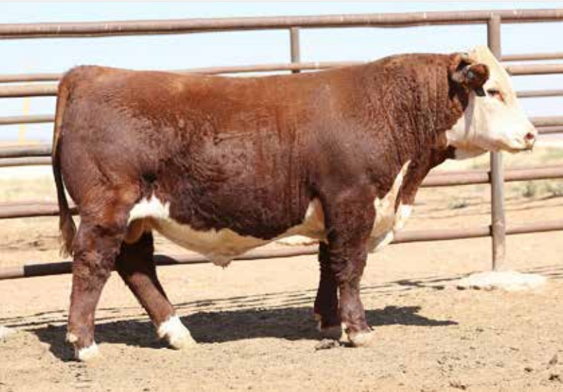
Lot 10 — PCC 6002 49C MIGHTY 9186