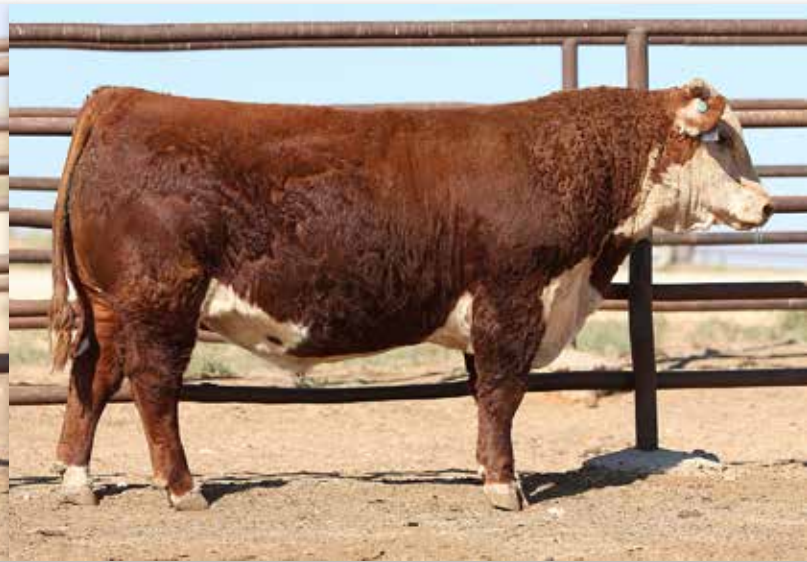
Lot 13 — PCC 2025 109Z HUTTON 9197 ET