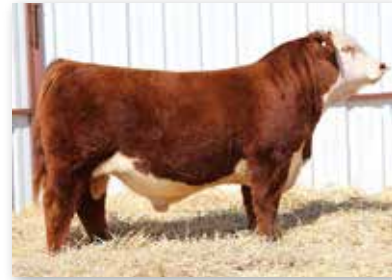
C&M LINCOLN 4036 Sire of Lots 17, 20, 22, 27 and 28