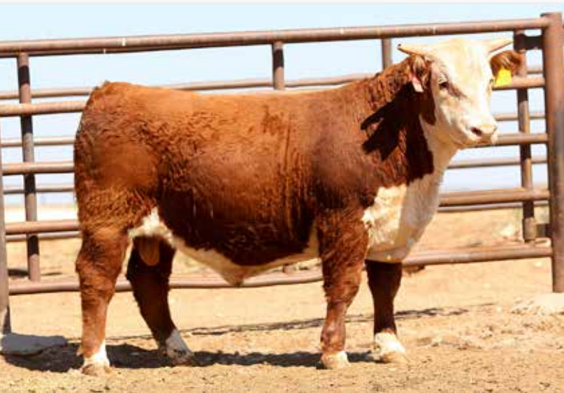
Lot 20 — PCC 6036 4036 LINCOLN 9238