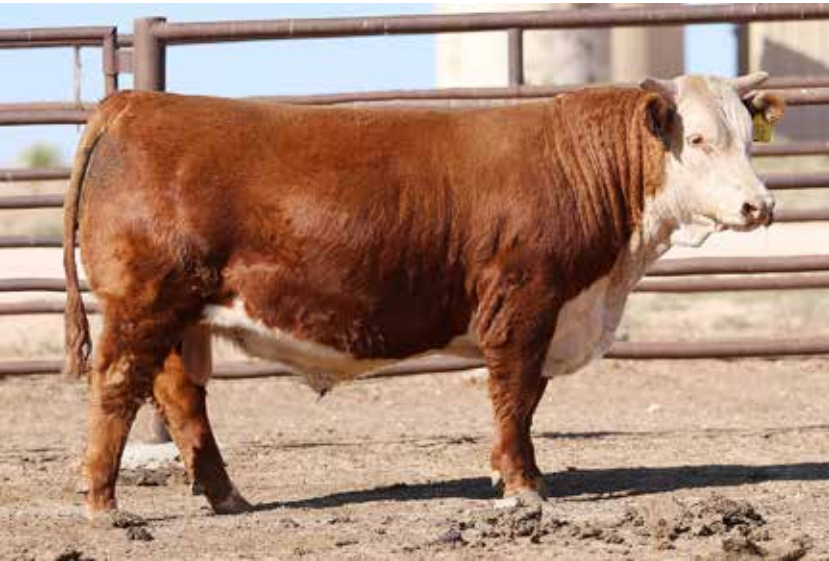
Lot 18 — PCC 7033 747 BAR S 9220

• Solid marked, dark red, heavy pigmented bull that's nice balanced and attractive.