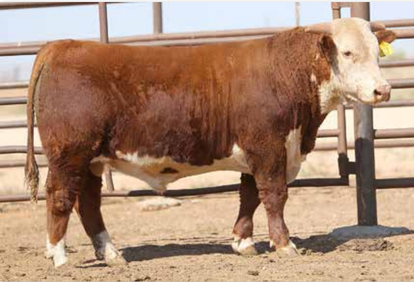
Lot 12 — PCC 7009 747 BAR S 9163