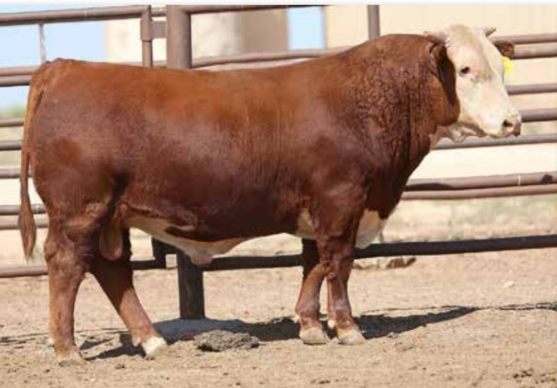
Lot 4 — PCC 5036 66589 MANDATE 9194 ET