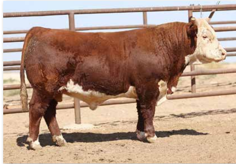
Lot 1 — PCC 4006 6105 RIBEYE 9170 ET