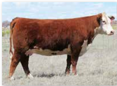
PCC NEW MEXICO LADY 7009 ET Dam of Lot 12