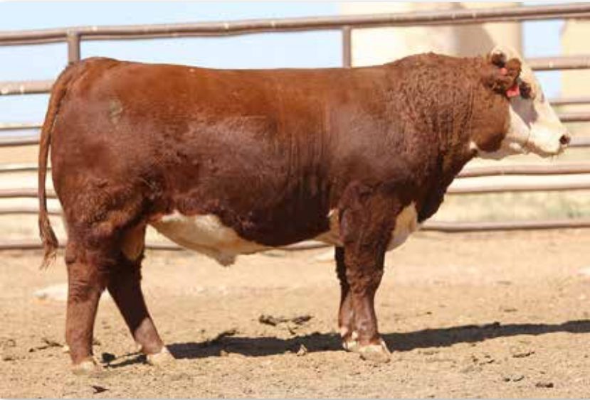
Lot 17 — PCC 5063 4036 LINCOLN 9214