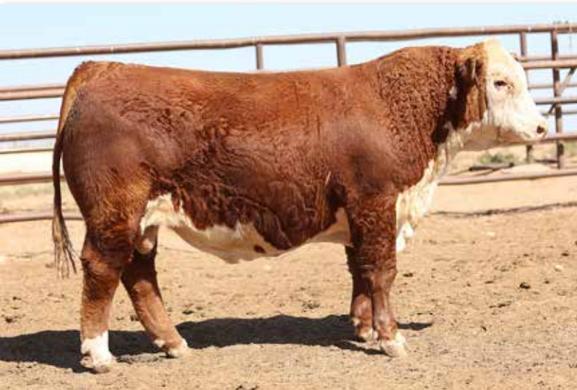
Lot 19 — PCC 17B RED POWER 9236 ET

• Moderate framed, deep bodied bull with true fleshing ability.