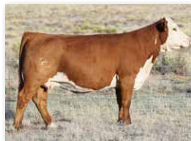
PCC NEW MEXICO LADY 5055 Dam of Lot 27