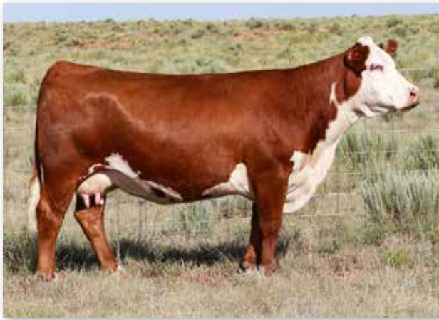
C&M KTP NEW MEXICO LADY 4006 - Dam of Lots 1 and 6