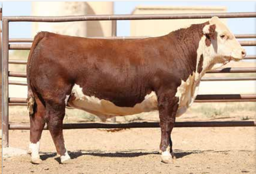
Lot 21 — PCC BC 115Z JOURNEY 9237 ET