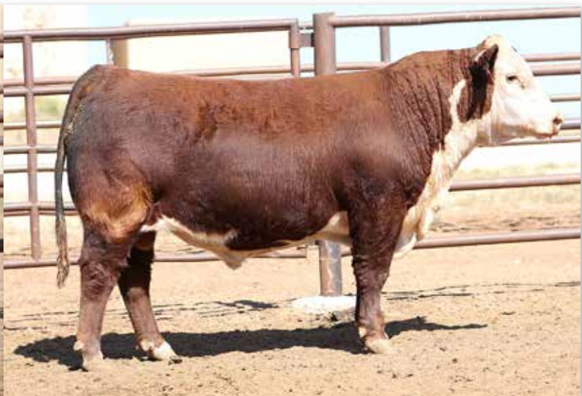
Lot 5 — PCC 143E 322 CATAPULT 9114