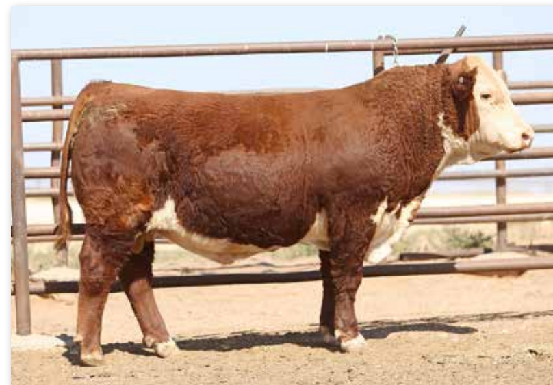
Lot 3 — PCC 4003 6105 RIBEYE 9184 ET