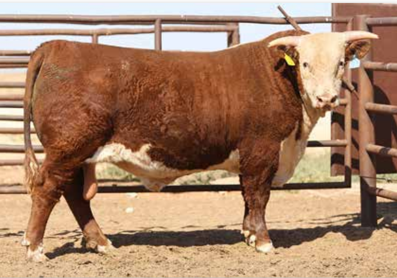
Lot 14 — PCC LHF DOMINO 914