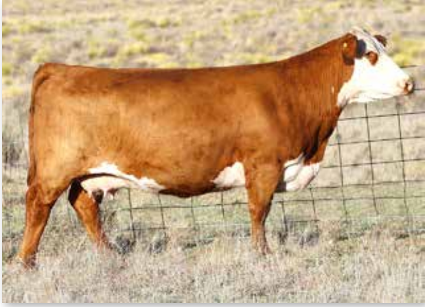
SR W49 CHRISTA 5036 ET - Dam of Lot 3