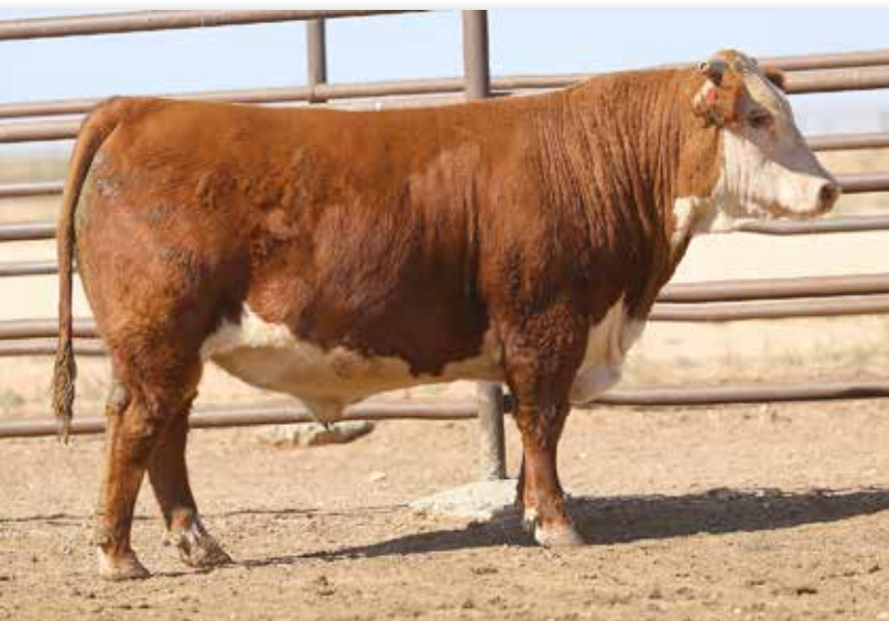
Lot 16 — PCC 7079 747 BAR S 9156