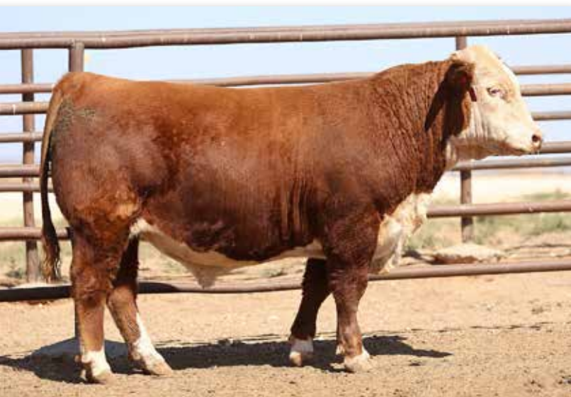
Lot 11 — PCC 7023 747 BAR S 9144