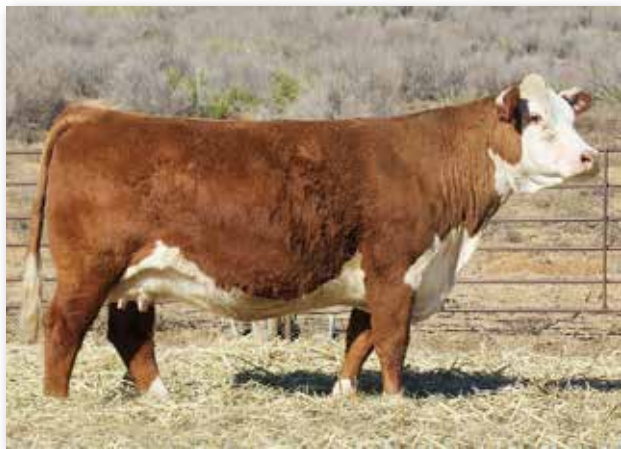
C&M NEW MEXICO LADY 3055 - Dam of Lot 8