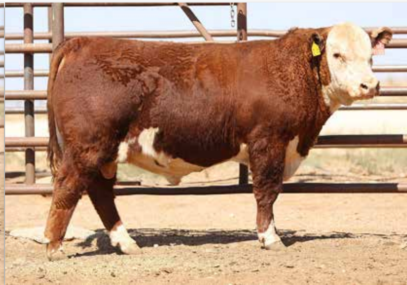
Lot 23 — PCC 7035 747 BAR S 9201