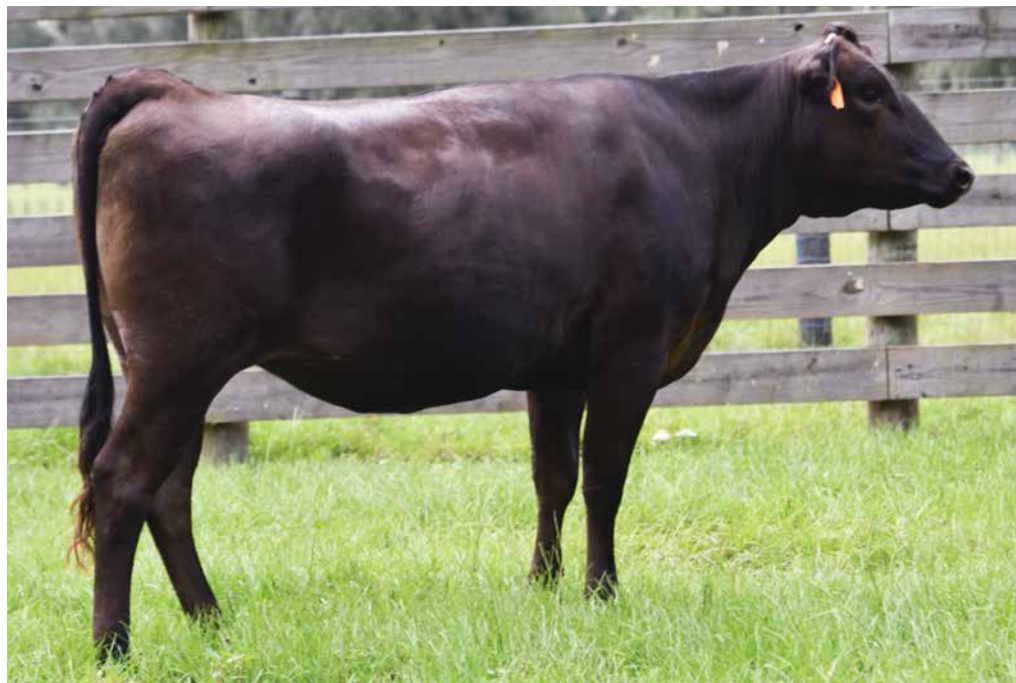
ML MS TOMIKO E067 ET Sells as Lot 52.

Four flush sisters implanted in consecutive years make up the 707T Family. They offer a nice blend of Fujiyoshi and Tajima for excellent carcass, marbling, marbling quality, Milk and size. As you can see, the Fujiyoshi influx has created females with extra length, depth and muscle. Whether you are wanting females to start a herd around or produce high quality, high yielding carcasses, these full sisters should be kept together!