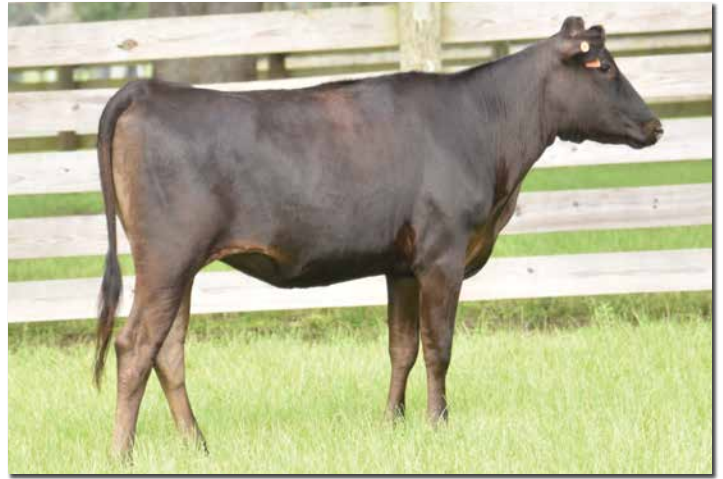
ML MS ITOSURUSHIGENAMI F103 Sells as Lot 6.

Add TF 148 genetics to the already powerful foundation genetics of this maternal line, and you are sure to get the balance of Carcass, Growth and Maternal traits. F103 in her own right is a good looking female with long, straight lines, a very feminine front end and a refined look. This is the king of cow prospect to build around.