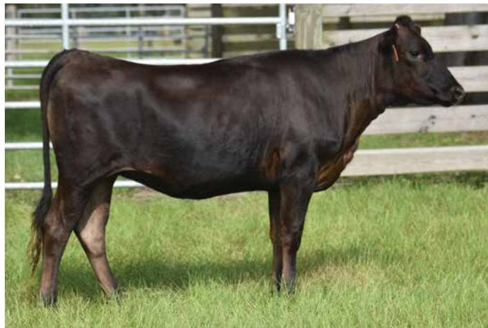
ML MS TAKAGISHIRO F041 ET Sells as Lot 36.

PE 4/28-7/9 to FB 27919. Preg checked safe and due 3/6/2021. Projected Heifer.