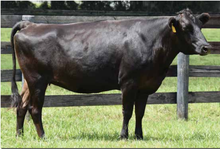
CX4 MS 13M-1018X-116Z Sells as Lot 57.