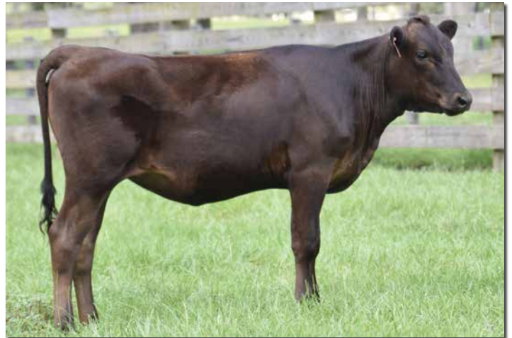
ML MS HARUKIRO G089 Sells as Lot 20.

This young female is one that offers big time potential. Just take a look at the way she follows in her dam's footsteps as far as her appearance. She is an eye-appealing female that has all the correct angles to her structure, and adds length to front end. All the genetics are there for Carcass and Growth. Take this one home and develop her as the next addition to your Embryo Transplant program.