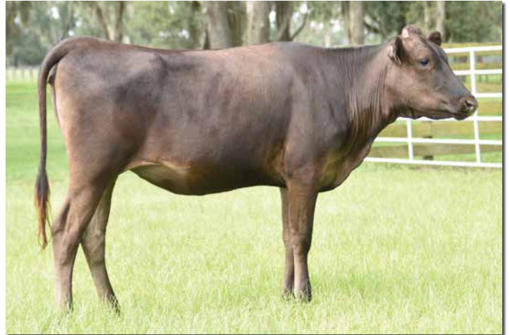
ML MS HARUKITOSHIGE G005 Sells as Lot 7.

G005 is very representative of the 191X cow family having, "The Look" of a female that will be a producer and the genetics to back it up with TF 148 in the pedigree.