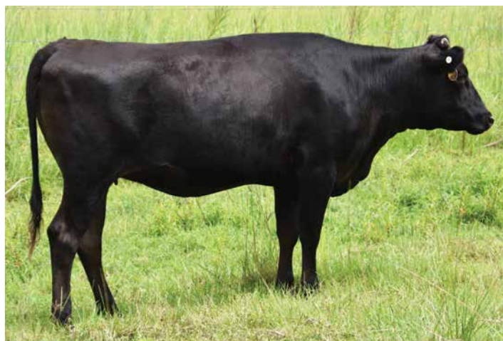
WFI MS SUZU OKU RIKITANI 33F ET Sells as Lot 32.

With 2 lines to Suzutani and lines to Okutani and Rikitani this young and still growing cow is bred to all the great foundational females of the Wagyu breed! We have heifers and embryos from this wonderful cow sired by BAR R NAKAGISHIRO 56T and her dam is another great cow, WSI FUJIKO 2. Don't miss out on this one! 33F was the dam of embryos in the recent Prime Harvest Auction that sold for $1,000 each.