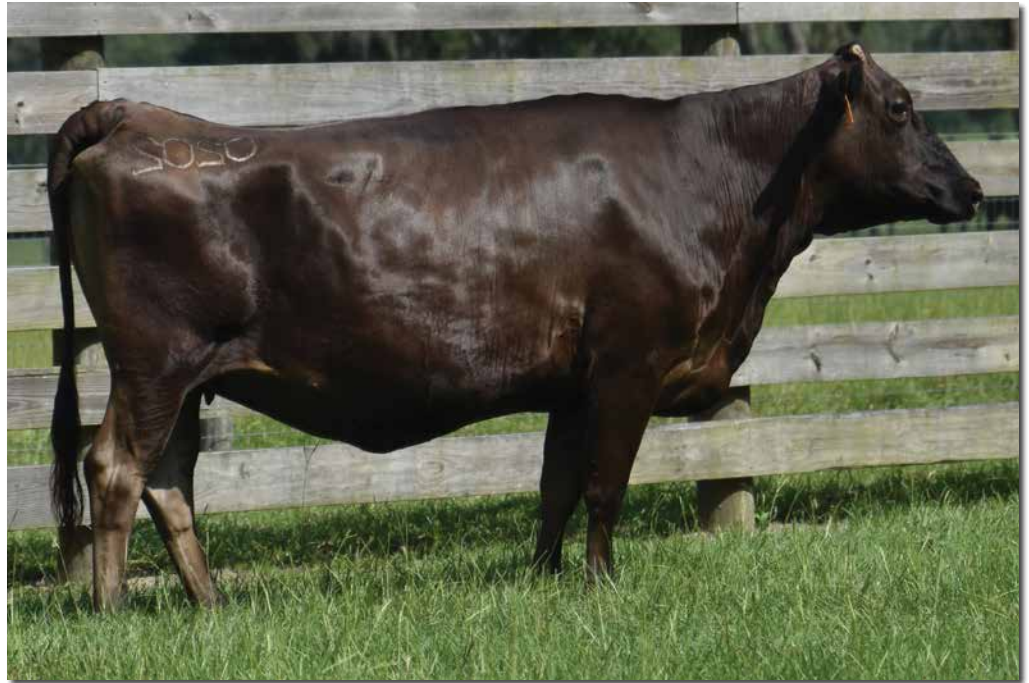
LMR MS HIRASHIGETAYASU 0202X Sells as Lot 22.

0202X is a cow that you should look to enhance the power of your herd. She has a real cow look, as she may be one of the deepest bodied Wagyu cows you will see. She comes by this naturally as her sire is in the top 1% of Breedplan for Milk and retail Yield, and top 10% for 200 and 400 day weight. He is also known for fertility as he ranks in the top 5% for Scrotal circumference. This is the kind of cow that can raise Herd Sires.