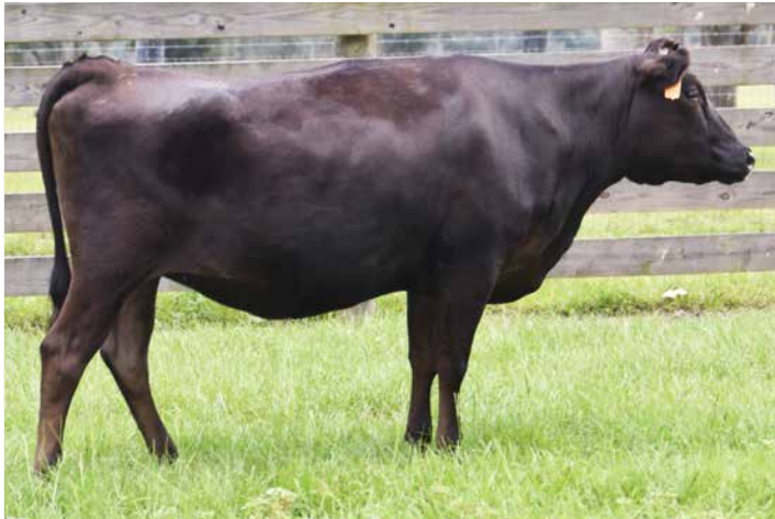
ML MS YASUFUKU D058 Sells as Lot 16.

16 ML MS YASUFUKU D058 Reg. No.: FB28463 100% BLACK, HORNED, Fullblood Cow Birth Date: 2016-12-22