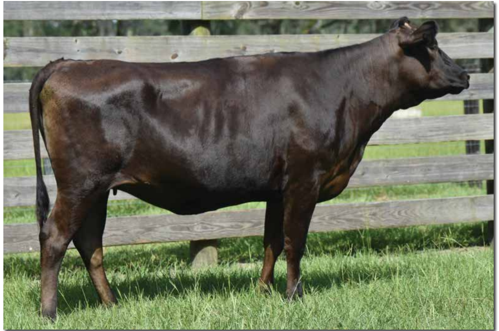
ML MS KIKUHANA D060 Sells as Lot 54.