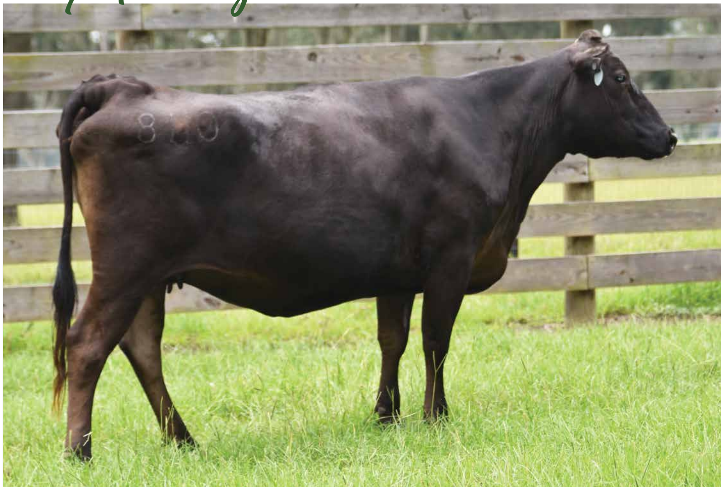
LMR MS TOSHIRO 1/3 0118X Sells as Lot 13.

13 LMR MS TOSHIRO 1/3 0118X Reg. No.: FB10935 100% BLACK, HORNED, Fullblood Cow Birth Date: 2010-02-07