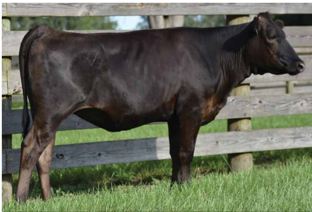
ML MS KIKUHANA F042 ET Sells as Lot 53.

Genetic Defects: FREE BY PEDIGREE PE 4/28-7/9 to FB 27919. Preg checked safe and due 3/6/2021. Projected Heifer.