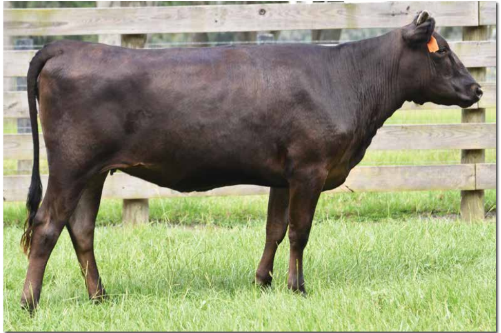
ML MS SANJIROU 4P E074 Sells as Lot 50.

Much like her mother this Yokosuru daughter presents a very refined elegance in her maternal appearance. Very long bodied and very angular in her shoulder and neck area. She is long and level over her hip, and has a flawless skeletal structure. The introduction of TF 148 from the sire side should improve marbling ability in the progeny.