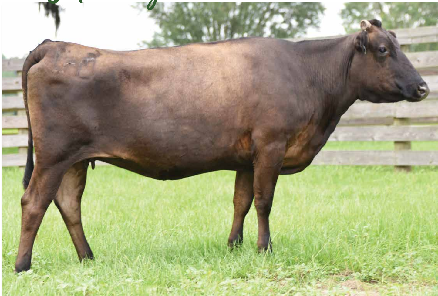
LMR MS HARUKI 1442Y Sells as Lot 1.