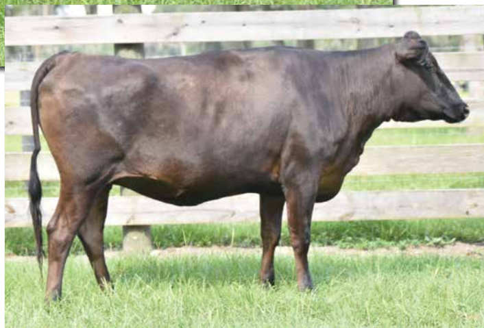
MLC MS WKSHIGESHIGETANI C132 Sells as Lot 34.