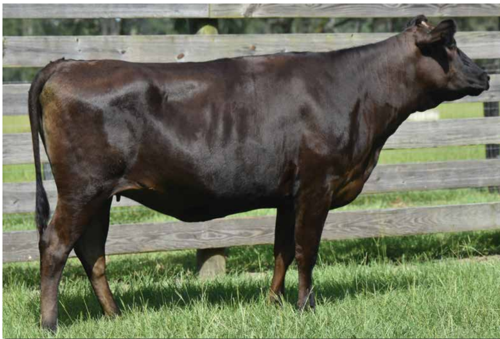
MLC MS KIKUHANA D060 Sells as Lot 55.

Genetic Defects: FREE BY PEDIGREE AI bred 4/17/2020 to FB 8177 BAR R 30T. PE 5/1-7/13 to FB 20585. Preg checked safe and due 1/27/2021. Safe AI.