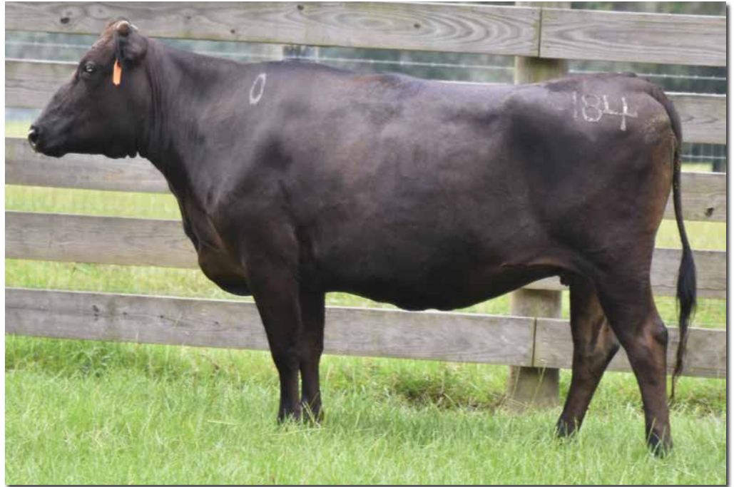
LMR MS KENICHI 0184X Sells as Lot 24.

The Matron of the 0184X family is certainly one that you will recognize when you go to your pasture. She has a distinguished look with her sound frame and structure, her level and powerful hip and a perfect angle to her shoulder to provide for longevity. She is safe in calf to Marbling and Carcass King 30T with a projected heifer calf, you can start your own 0184X family with a powerful calf like this. Stout, sound and clean jointed with a great stride, continue the legacy of 0184X.