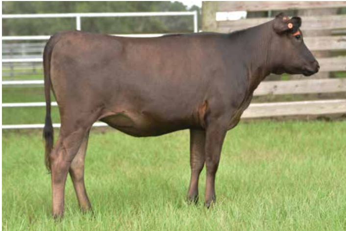
ML MS SHIGEITOSHEGENAMI F109 Sells as Lot 26.