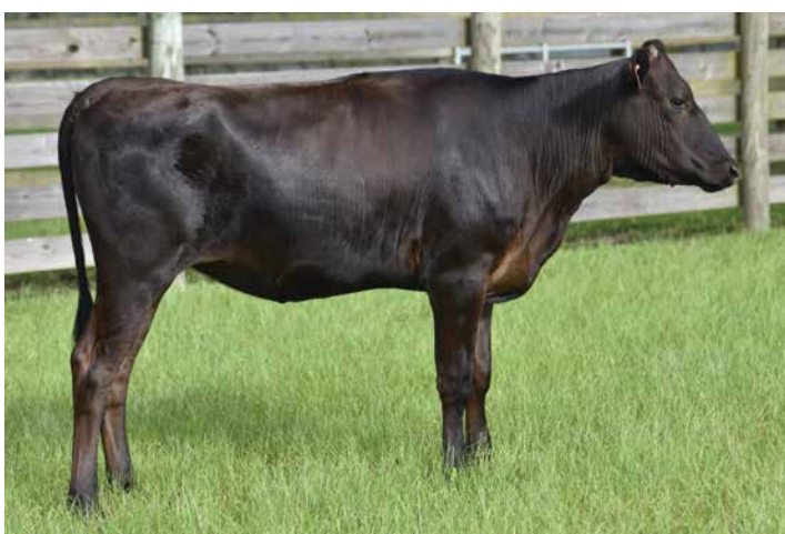
ML MS TAK 741T MACHO F084 Sells as Lot 39.