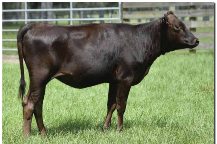
ML MS KOUSYUN G094 Sells as Lot 43.

This direct daughter of 741T is just a young December heifer, but is already starting to show the muscle definition of her maternal line with plenty of depth.