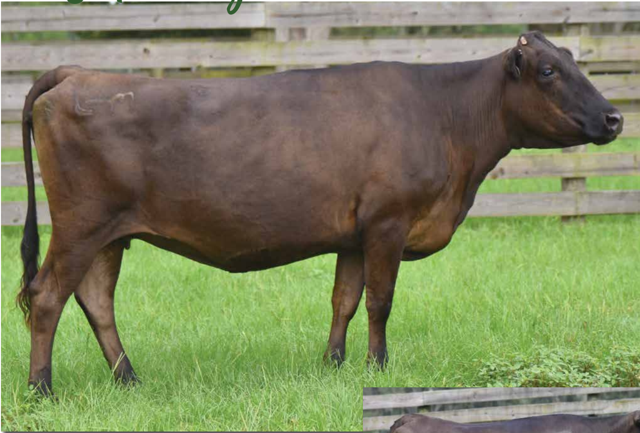
LMR SHIGESHIGETANI 1210Y Sells as Lot 9.