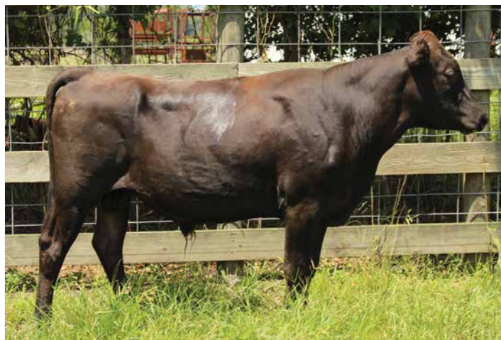
CB 301G Sells as Lot 68.

Here is an extremely long and powerful son of Tajimax. This pedigree offers the tops in Carcass traits.