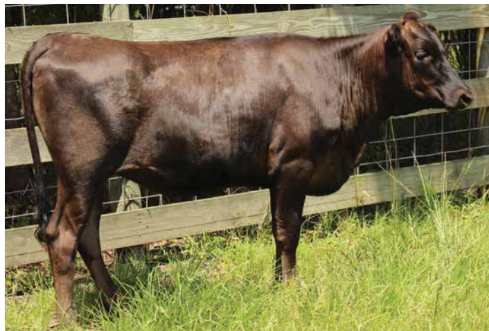
CB CROSSBOW MS BEEF 312G ET Sells as Lot 66.

Bred in the famous Tally Windham program, this Shigesigetani daughter offers a life of potential. She is a deep bodied, huge hipped female, that has a pedigree built to last. This female projects to have the best of Marbling, Growth and Maternal traits.