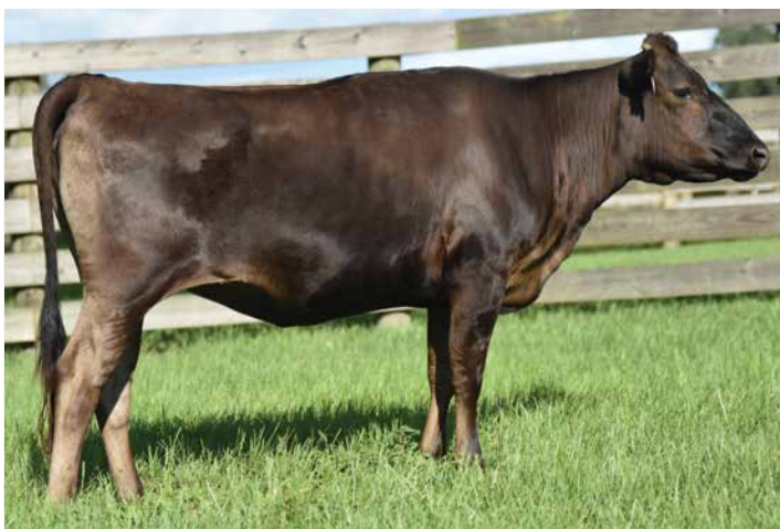
ML MS YASUFUKU 2 F035A Sells as Lot 17.

D058 is a full sister to C137. She is a huge bodied cow with size, volume and a giant rib-cage. Her genetics, as her full sister, are very well balanced in carcass, growth and maternal traits. With her dam in the upper echelon for growth and Milk, and her sire in the top 5% of Breedplan for both Marbling Score and Marble Fineness. If you are looking for proof of what kind of cow she is, look no further than the twin daughters she raised as lots 17 and 18.