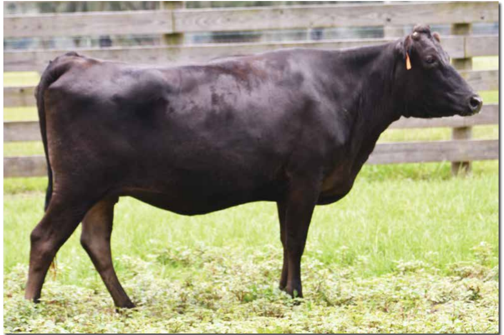
ML MS TOSHIROYOJIMBO 105B Sells as Lot 14.

As you would expect with this mating of 0118X and former high selling Lone Mountain herd sire Yojimbo, 105B has the depth and body you are looking for in a brood cow. She is again very structurally correct and has adequate length. This is a power cow with growth.