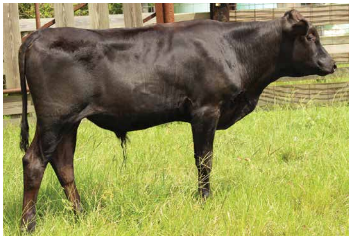
CB313G Sells as Lot 67.

If you are looking for a herd sire that offers a real balance of traits, this full brother to lot 66 is your man.