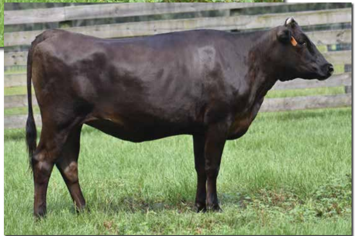
ML MS ITOMORITAKA D055 Sells as Lot 10.

9 LMR MS SHIGESHIGETANI 1210Y Reg. No.: FB11918 100% BLACK, HORNED, Fullblood Cow Birth Date: 2011-03-09