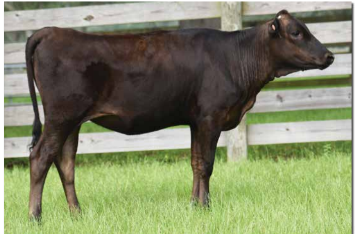
ML MS HARUKIRO G085 Sells as Lot 42.

Another AA 10 female from the 741T line. This young female has the appearance to follow in the genetic footsteps of this great family with solid structure and abundant muscle.