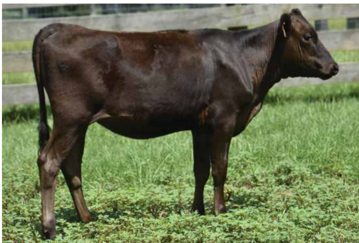
ML MS HARUKIRO G087 Sells as Lot 28.

G083's sire is a direct son of the most noted bull ever in Japan. From this cow line she will prove to be a significant prospect to build a cow herd.