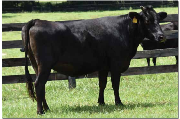
CX4 MS 36M-9038W-135A Sells as Lot 59.

A paternal sister to lot 58, this cow's dam descends from the most noted bull in Japan Yasafuku 930. She is a deep bodied powerhouse that offers the best of size, milk and carcass.