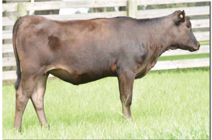
ML MS ITOMORITAKA G079 ET Sells as Lot 47.

The introduction of Kedaka to this pedigree should add size and an abundance of marbling to G079 and G080, lots 47 and 48.