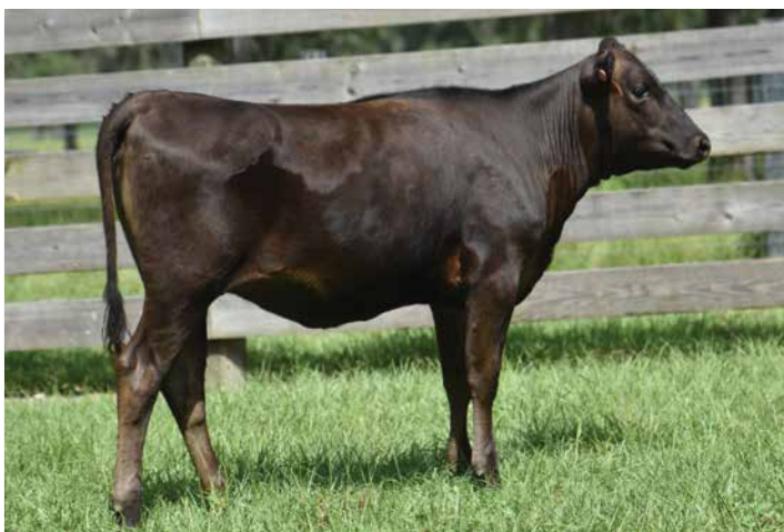
ML MS KOUSYUN G083 Sells as Lot 27.

F109 is one you should pay special attention to. She exhibits a refined yet powerful look, with all you could ask from her structure and stride. She combines all of this with a Genetics explosion that includes Itoshigenami, Michifuku, Takazakura, Shigeshigetani, and JVP Fukukane. She will be in someones Donor pen for years to come.