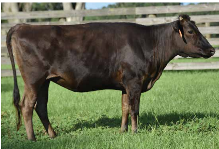
ML MS YASUFUKU 2 F035B Sells as Lot 18.

Genetic Defects: F11C PE 4/28-7/9 to FB 27919. Preg checked safe and due 2/24/2021. Projected Bull.