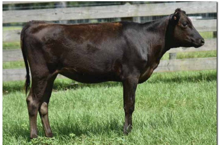
ML MS KOUSYUN G096 Sells as Lot 8.

This calf out of 191X is a direct daughter of Kousyun, who is a direct son of the great Yasufuku J930 who is the most highly recognized bull in all of Japan. Kousyun is known to produce carcasses with very fine marbling.