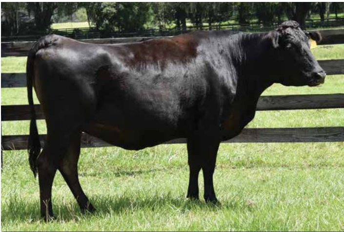
CX4 MS HIROSHIGE 114Z Sells as Lot 62.

You will find the ever popular Haruki 2 in the pedigree of this beef machine. Look at the big shape of muscle down her top and the thickness of her quarter. Big and deep ribbed, this is a big time producer.