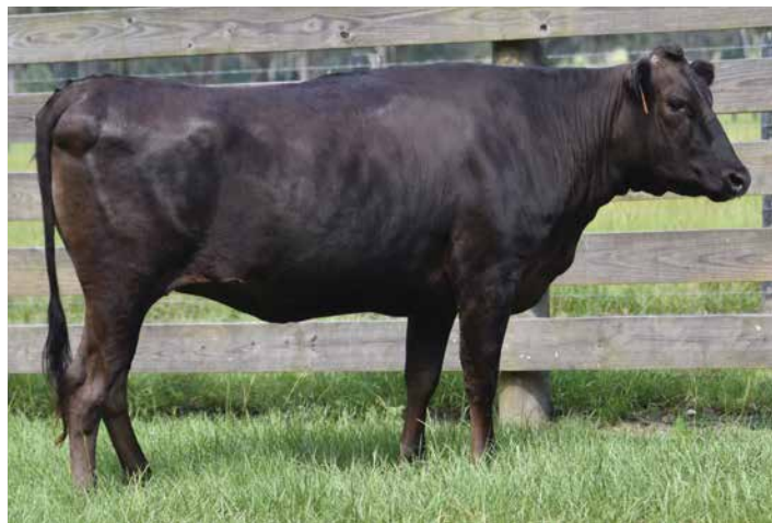
ML MS TAK-3612 E066 Sells as Lot 35.

E066 represents an excellent blend of Carcass and maternal traits having both TF 151 and TF 148 in her pedigree. She is a thick ended cow with ample muscle throughout her body structure.