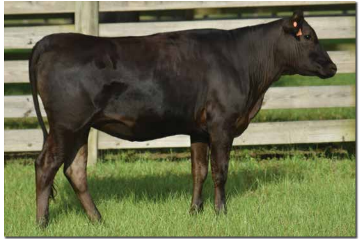
ML MS SHIGEMACHO F094 Sells as Lot 41.

AI bred 8/28/2020 to FB 14967 AOICHI 2468Z. Preg checked safe and due 6/9/2021. Safe AI.