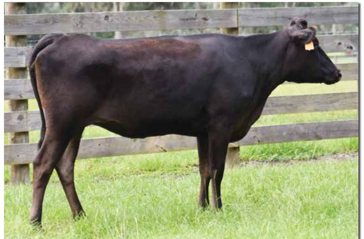
ML MS TOSHIROYOJIMBO E063 Sells as Lot 21.

The potential Michifuku heifer calf that this female is carrying is a true home run just waiting to happen.