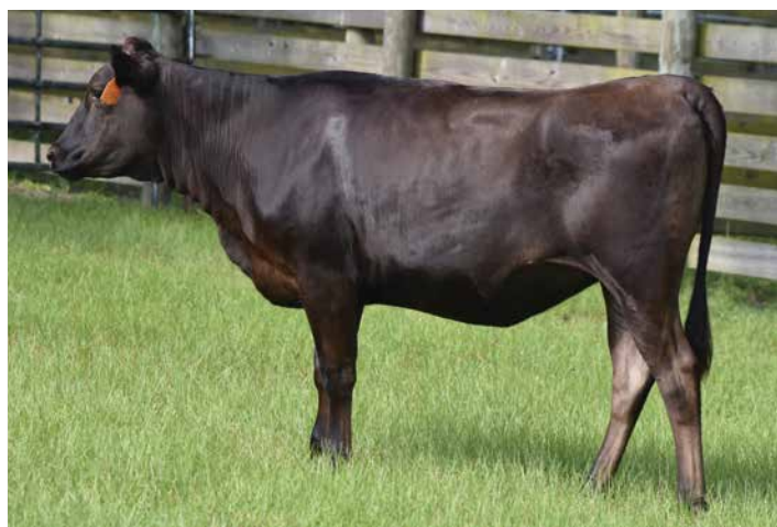
ML MS TAKAGISHIRO F045 ET Sells as Lot 37.

PE 4/28-7/9 to FB 27919. Preg checked safe and due 2/7/2021. Projected Heifer.