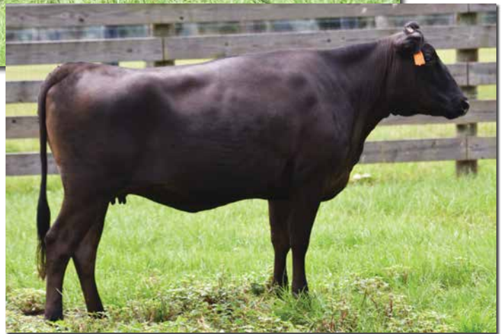
MLC MS ITOSURU DOI D024 Sells as Lot 45.