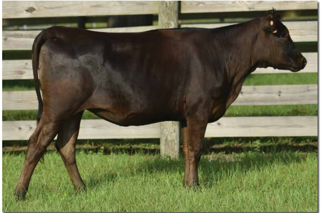
ML MS SHIGEMACHO F092 Sells as Lot 11.

F092 falls right in with the power and structure of her Dam 1210Y. She is very long bodied and big ribbed. She is safe in calf AI to Aoichi, the Lone Mountain TF 148 son that ranks in the top 20% of Breedplan for Marbling.