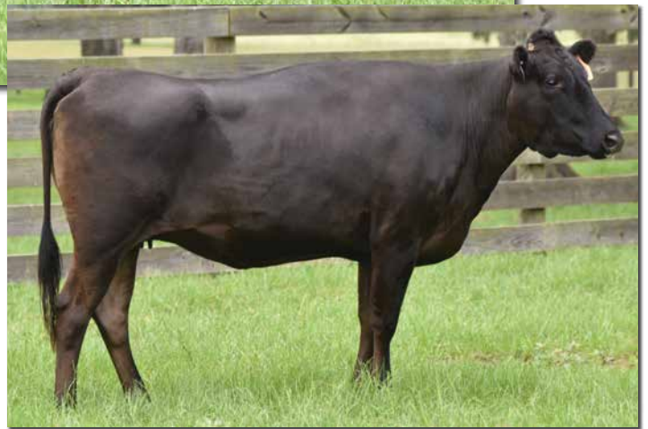
MLC MS ITOSURU DOI D020 Sells as Lot 5.