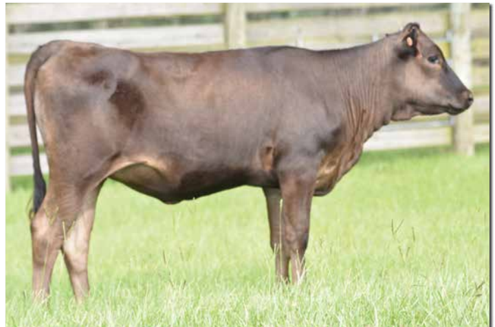
ML MS ITOMORITAKA G080 ET Sells as Lot 48.