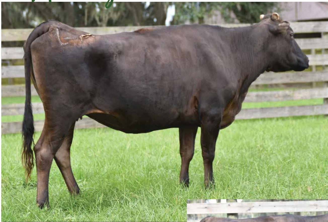
LMR MS TAK-3612 741T Sells as Lot 33.