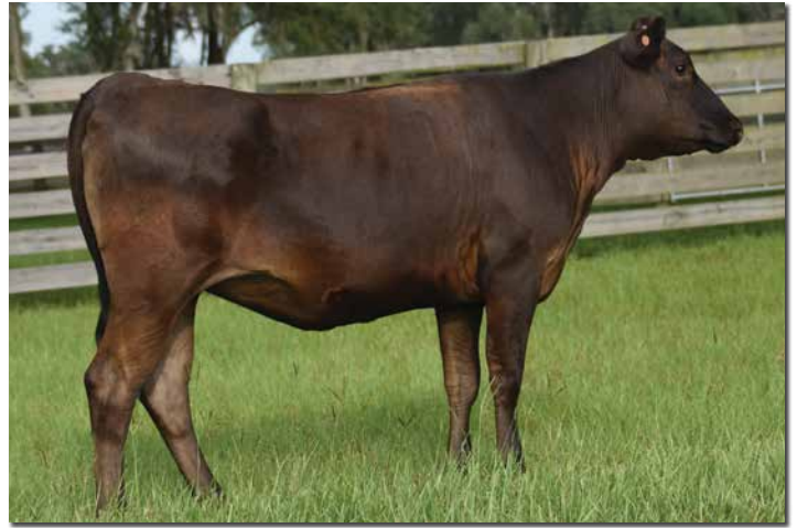
ML MS YASUMACHO F095 Sells as Lot 19.

F095's dam sells as lot 15. Again from the 0118X line this female adds Tekada Farms genetics with TF 147 Itoshigefuji. Many will tell you that if you can get TF 147 in a recessive free pedigree, you need to tie in, as these are the best producers of top quality beef, and Donor cows.