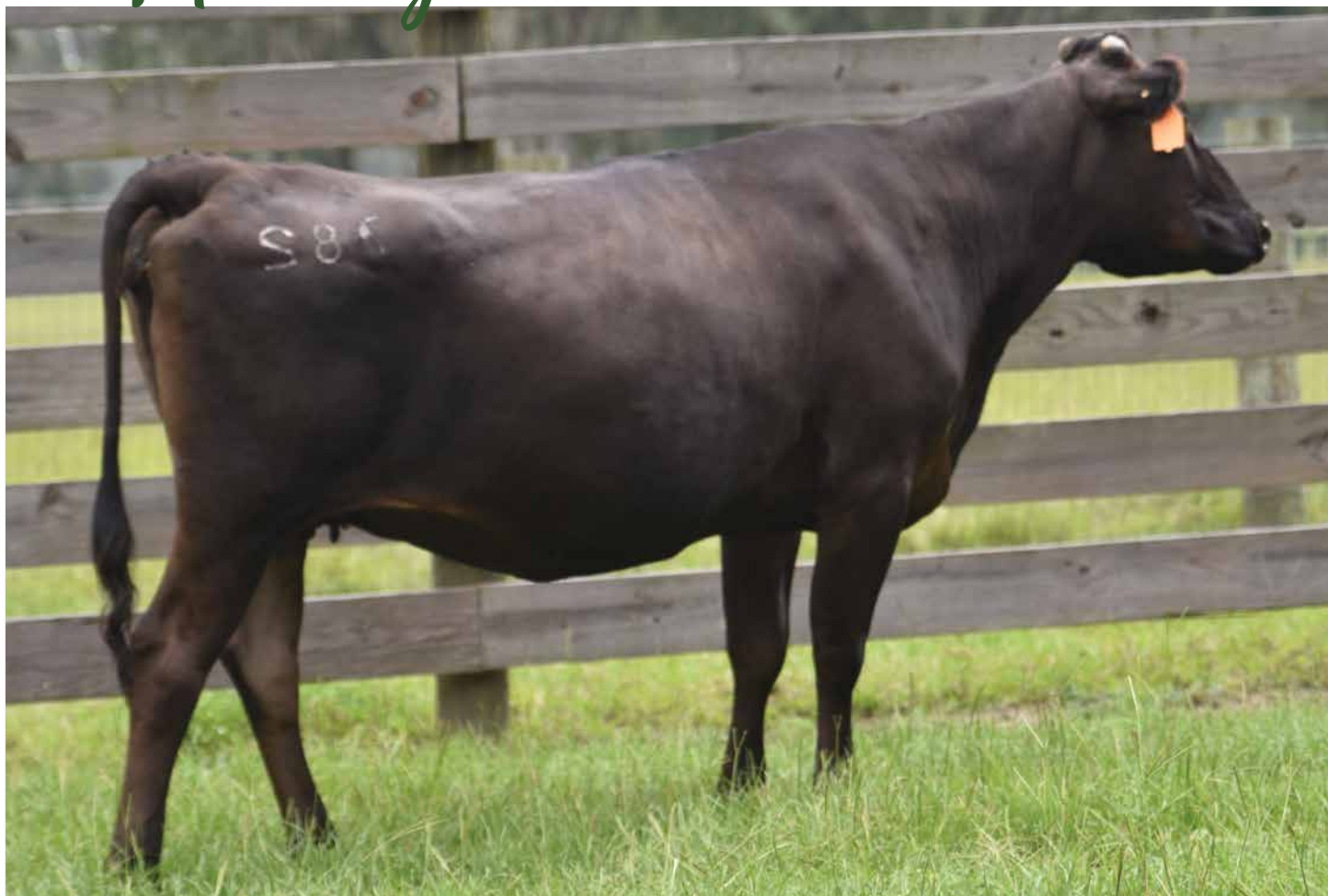
LMR TOMIKO Sells as Lot 49.