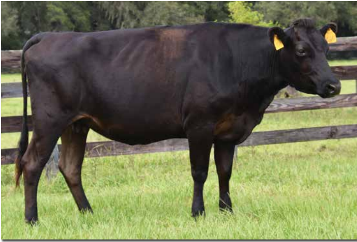
TBR TOMIKO 1-1 2058Y Sells as Lot 56.

56 TBR TOMIKO 1-1 2058Y Reg. No.: FB13395 100% BLACK, HORNED, Fullblood Cow Birth Date: 2011-11-19