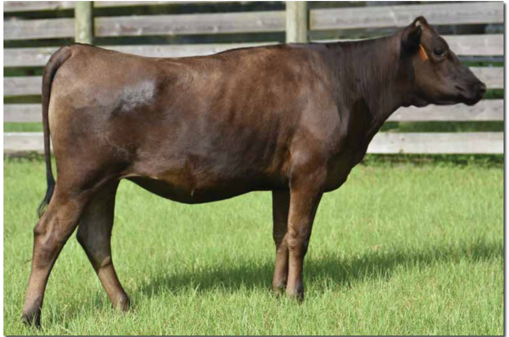
ML MS HARUKIFUKU F043 ET Sells as Lot 2.

F043's sire is TBR Mitsufuku 9028W, who is a big bodied, huge ribbed bull that has lots of muscle. Combined with her well balanced dam 1442Y, F043 projects to be a future cornerstone to any Donor program. Added Muscle, Milk, Marbling and size is tied up in a smooth shouldered, nice fronted female.