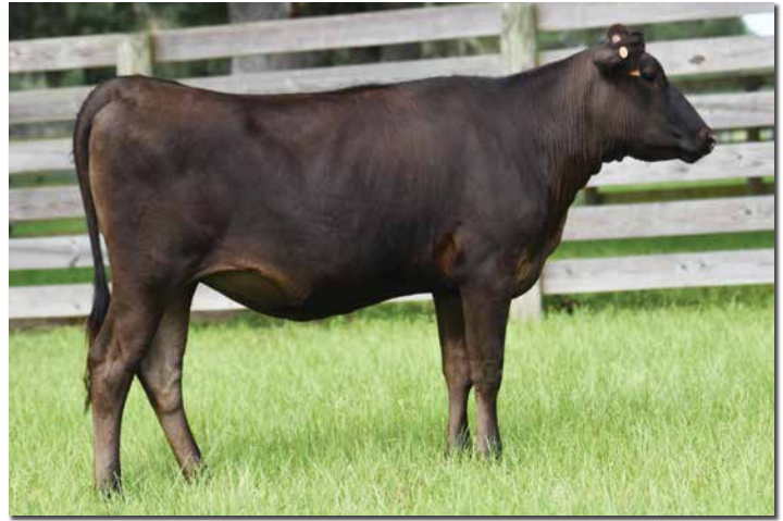
ML MS ITOSURUSHIGENAMI F107 Sells as Lot 46.

This direct daughter of power cow D024 shows the same depth and capacity, as well as carrying her muscle deep into her quarter. The addition of TF 148 to her pedigree gives her more ability to produce outstanding marbling.