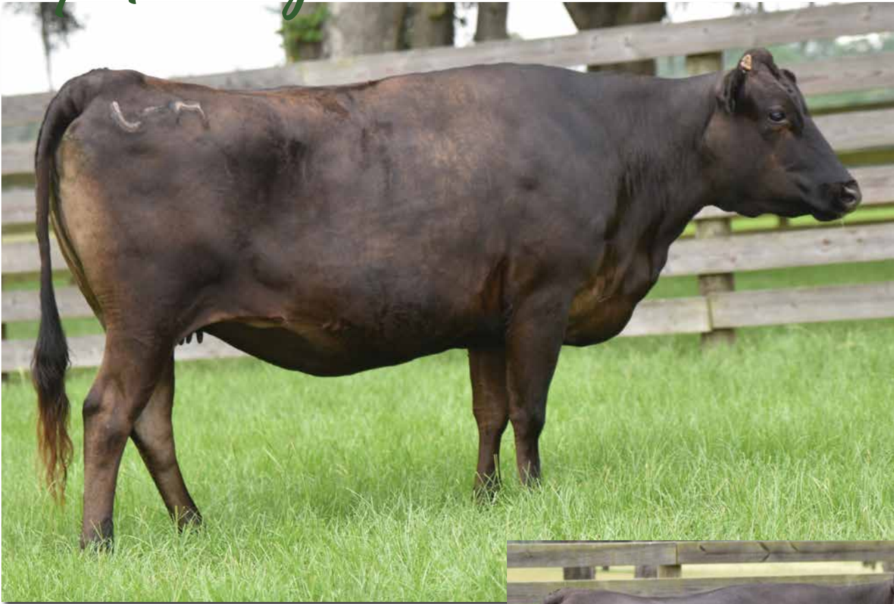
LMR MS HARUKI 0191X Sells as Lot 4.