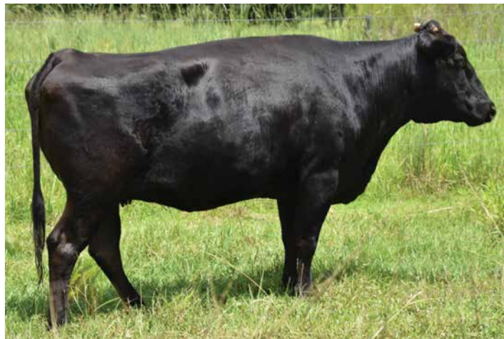
CX4 MS SANJIROU 303C Sells as Lot 31.

Her dam was one of the highest rated females at LMR during her day. This gal has tremendous size, length, and massive hind quarters along with the Sanjiroeu eye muscle. She was sired by Takazakura a great marbling sire. Another female with great potential for your herd! We have had heifers from her and so don't let this one go. 303C was the dam of the high selling embryos in the 2019 Steaks are High Sale at $1,500 each.