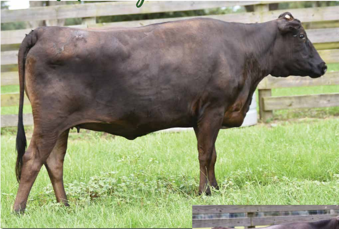
LMR MS YASUFUKU JR 9337W Sells as Lot 44.