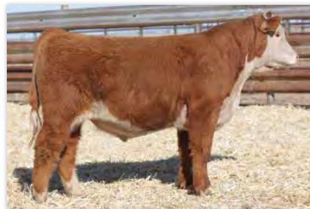
LOT 46 - JCS 8340 DYNAMITE 0805