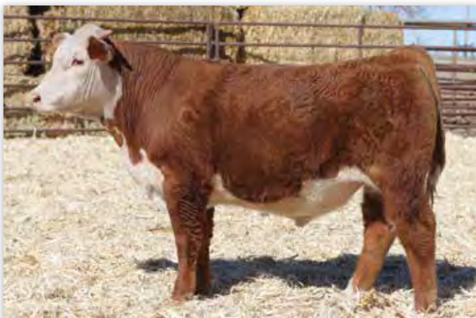
LOT 36 - JCS FULL FORM 0830