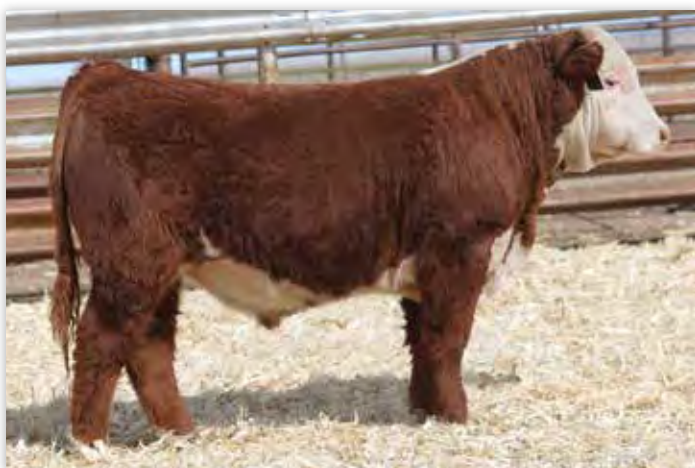
LOT 12 - JCS HOMEBREW 0733