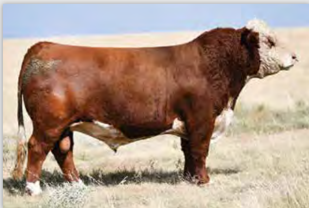
JCS ROYAL BLEND 7210 ET - REFERENCE SIRE A