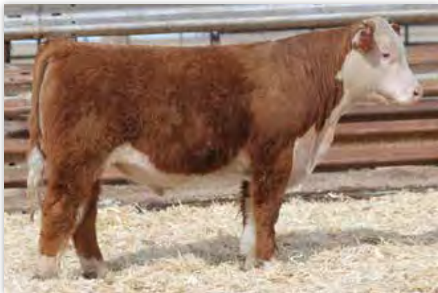
LOT 43 - JCS 8340 DYNAMITE 0773