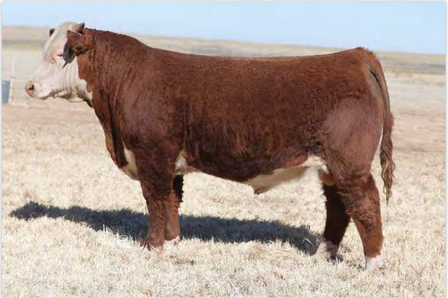
LOT 5 - JCS 5847 DOMINO 0890 ET