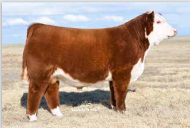
JCS 88X 5847 ET - REFERENCE SIRE D