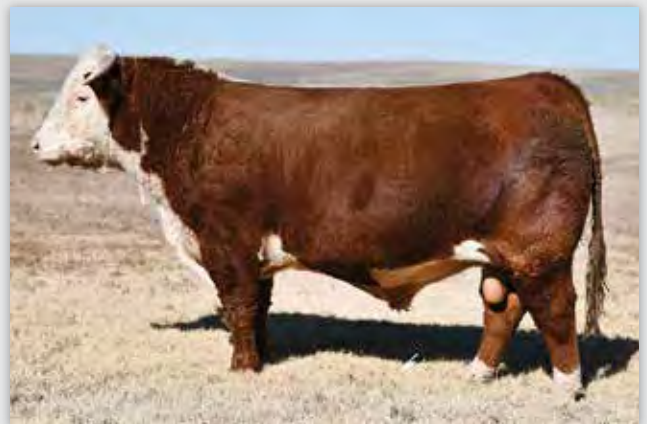
JCS ENCHANTMENT 7317 - REFERENCE SIRE G

• Owned with GKB Cattle • Semen: $75 / Certs: $75