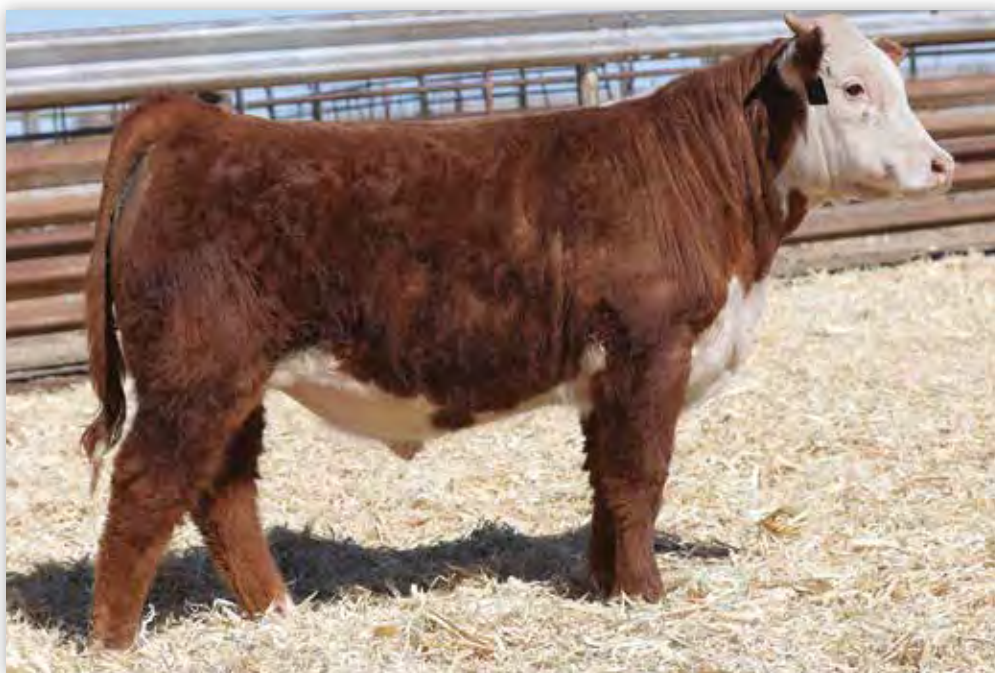
LOT 15 - JCS HOMEBREW 0749