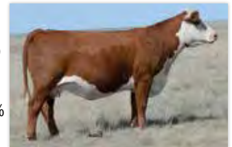
LOT 7 DAM - DF 18U BRITTANY 907 1405 ET