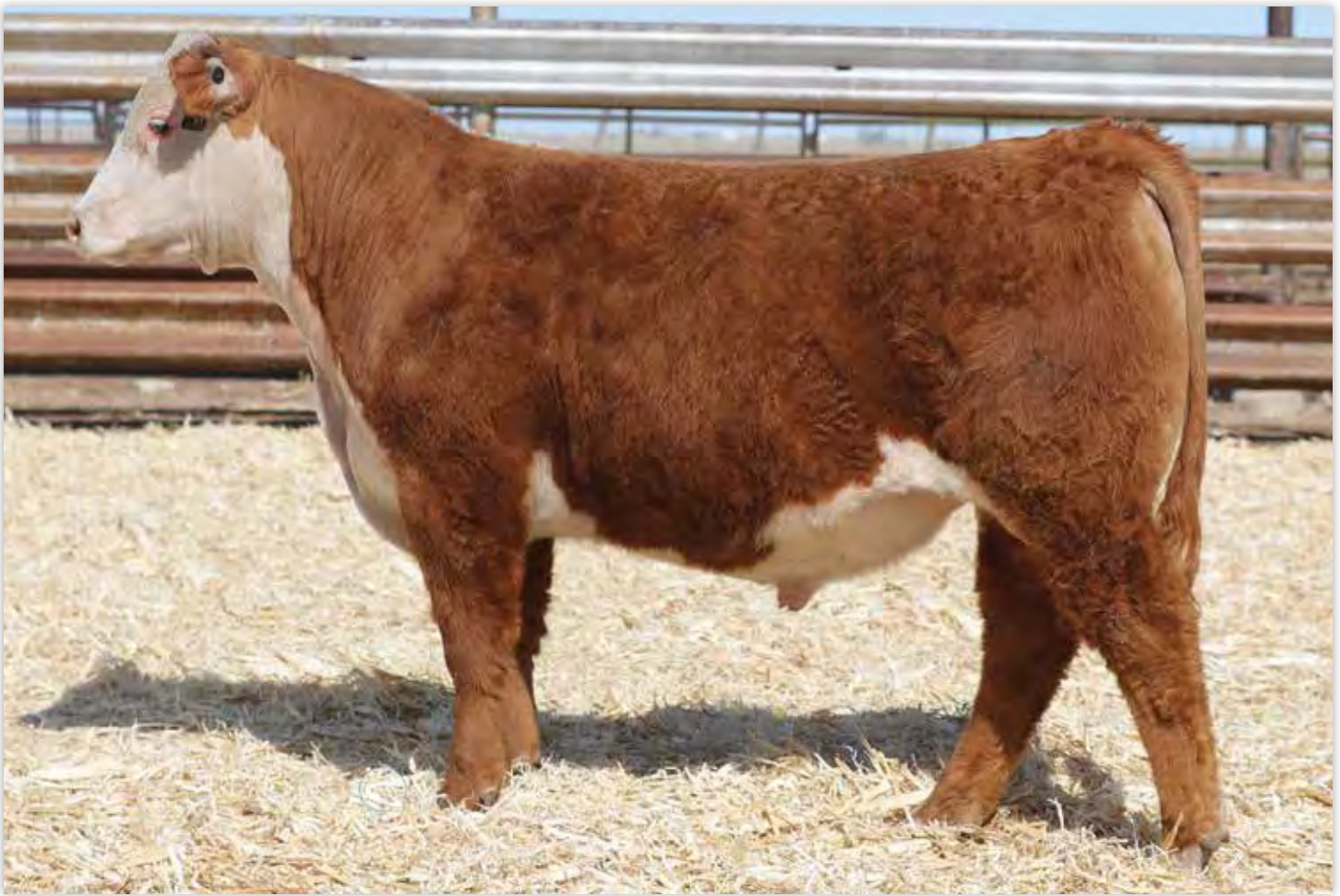
LOT 16 - MAT ENCHANTMENT 0759