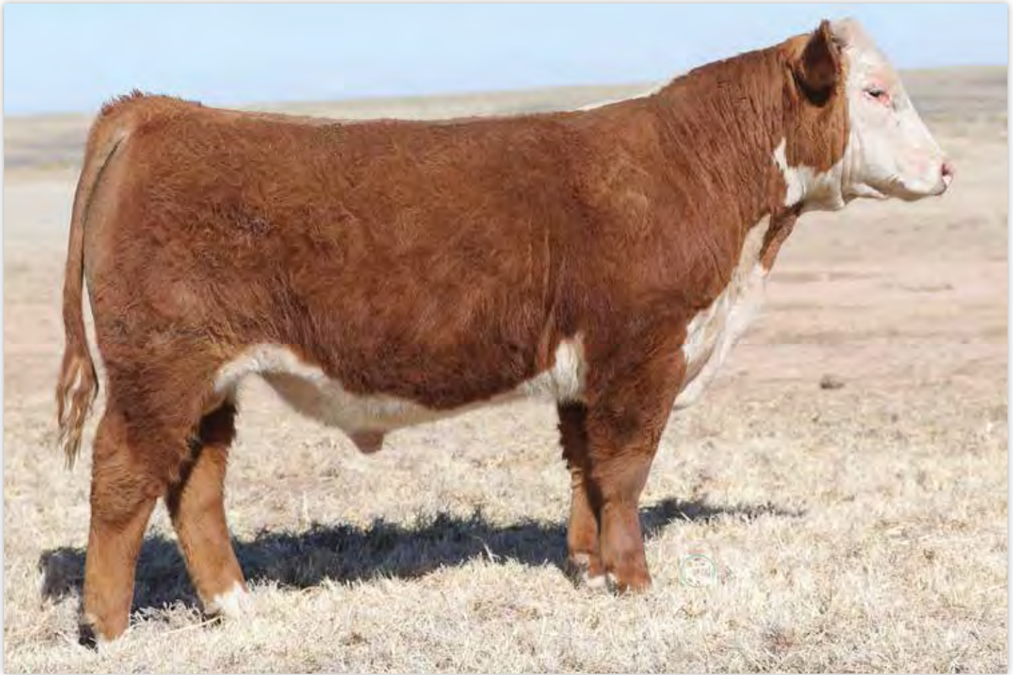
LOT 18 - JCS ENCHANTMENT 0827