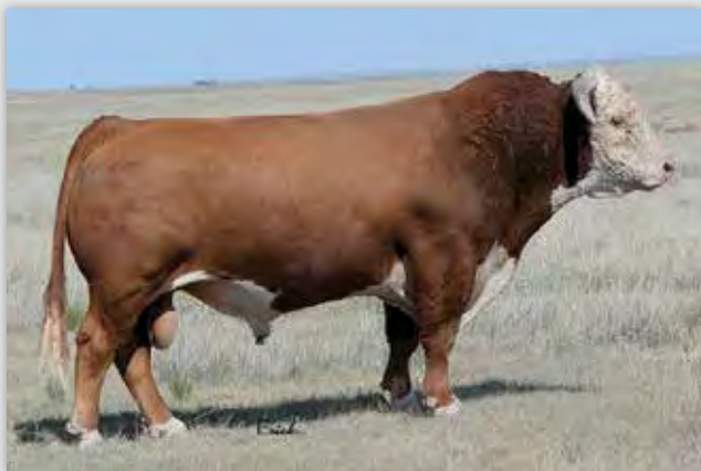
BAR S LHF 028 240 - REFERENCE SIRE C