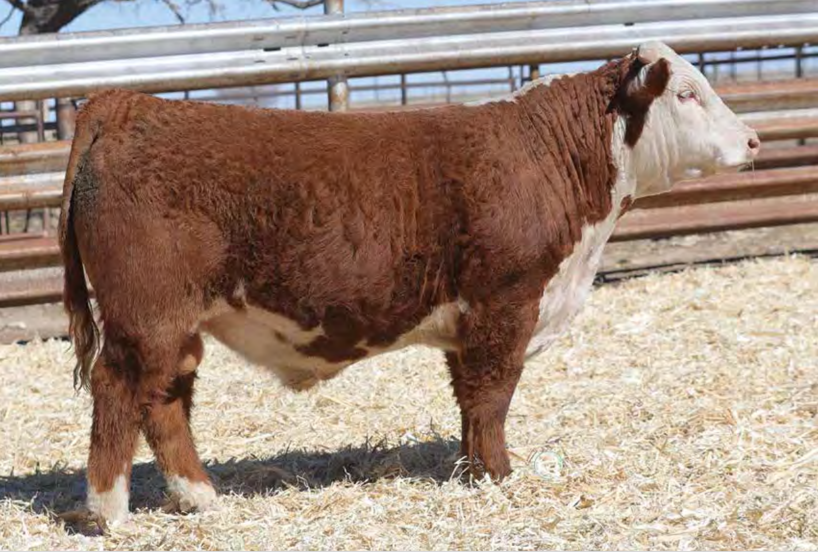
LOT 1 - JCS 100 PROOF 0880 ET