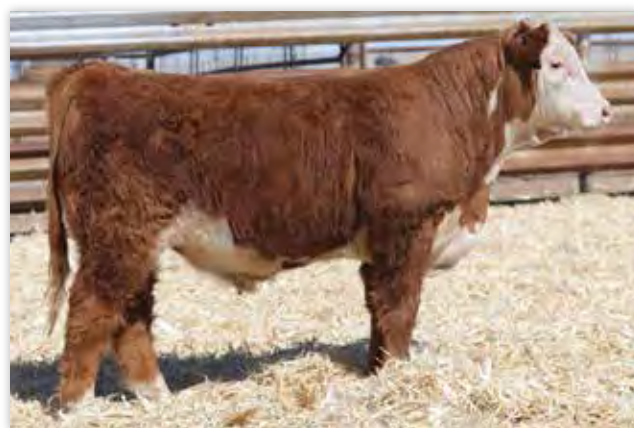
LOT 45 - JCS 8340 DYNAMITE 0828