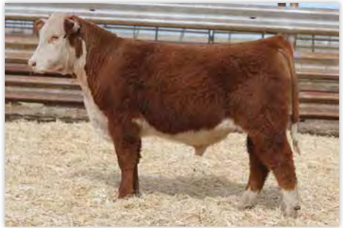
LOT 20 - JCS ENCHANTMENT 0782