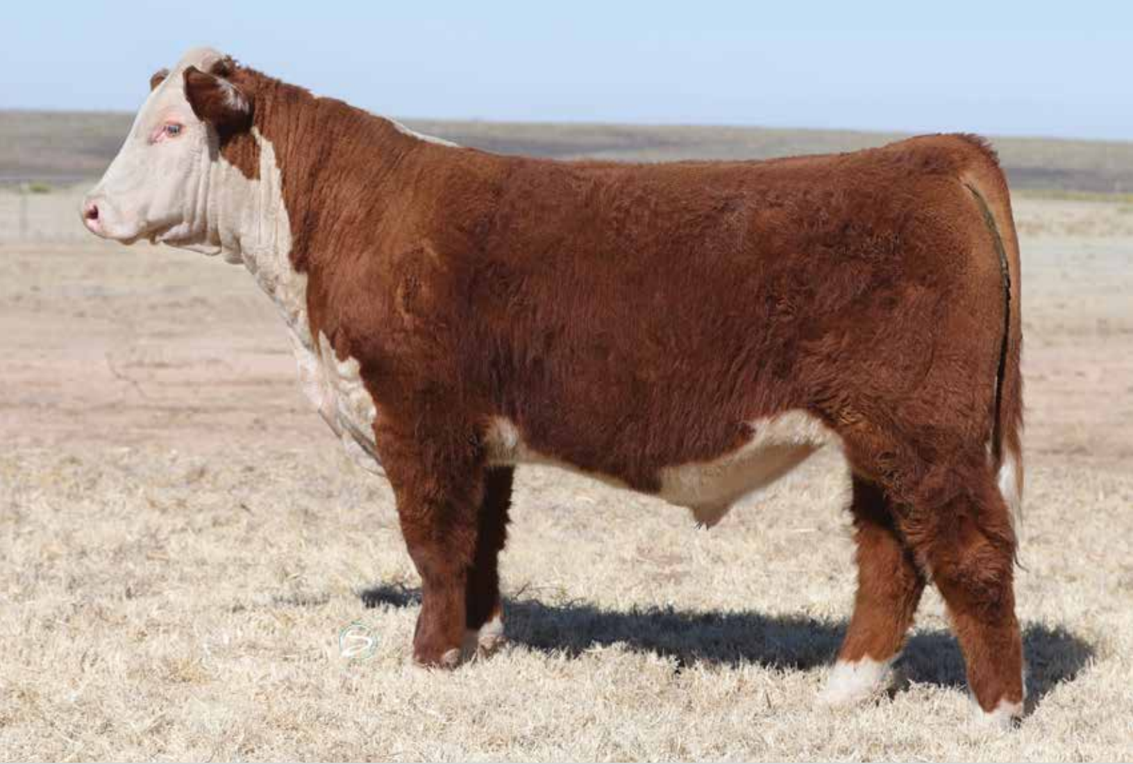
LOT 2 - JCS 4641 ICON 0750