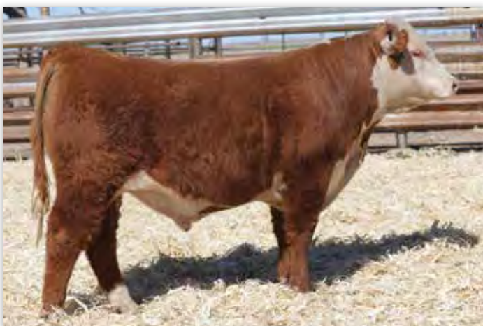
LOT 25 - JCS 7314 COPPER 0771