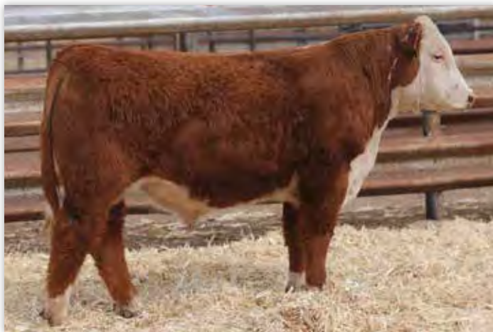
LOT 30 - JCS 7314 COOPER 0794