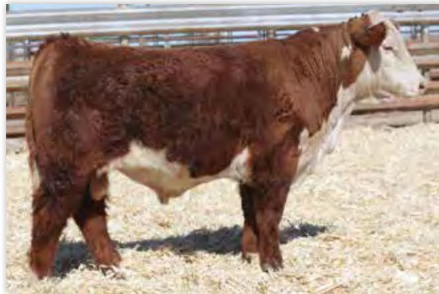
LOT 44 - JCS 8340 DYNAMITE 0797