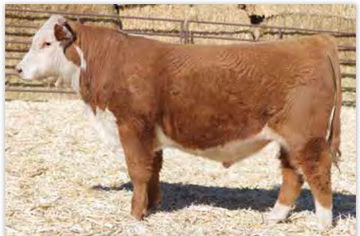
LOT 28 - JCS 7314 COPPER 0758