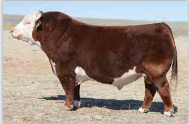
JCS HOMEBREW 4616 ET - REFERENCE SIRE F

• Owned with Lamle Herefords • Semen: $50 / Certs: $75