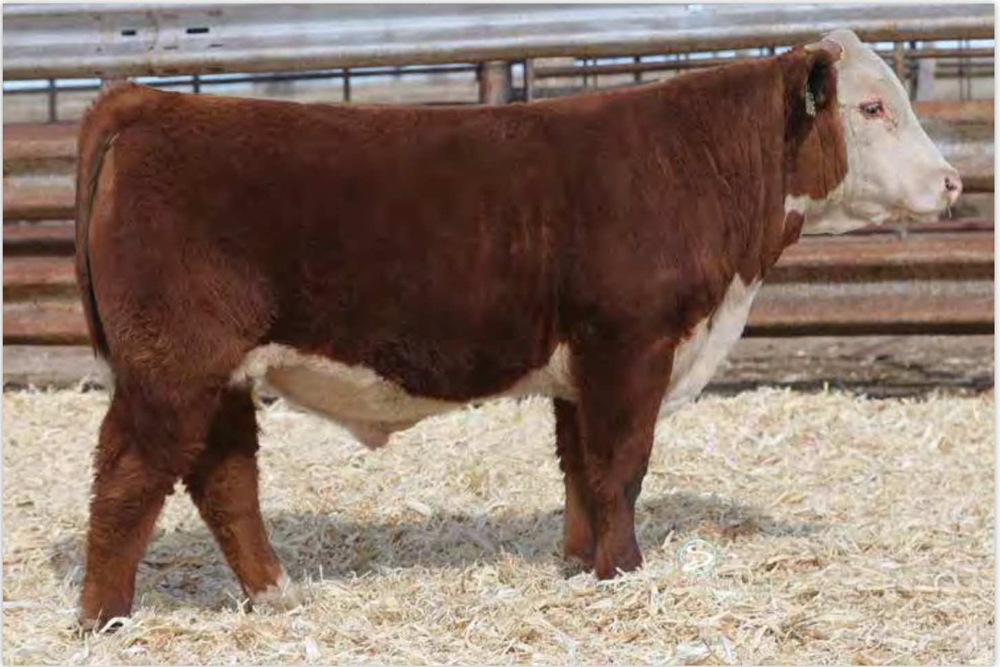
LOT 40 - MAT 8442 DOMINO 0806