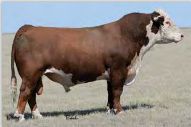
JCS ICON 4641 - REFERENCE SIRE B