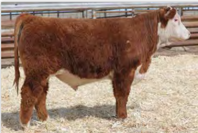
LOT 24 - JCS 7314 COOPER 0824