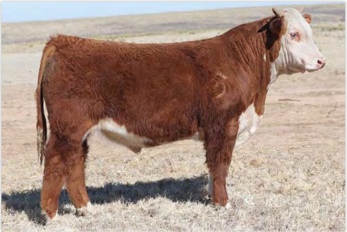
LOT 33 - JCS FULL FORM 0754