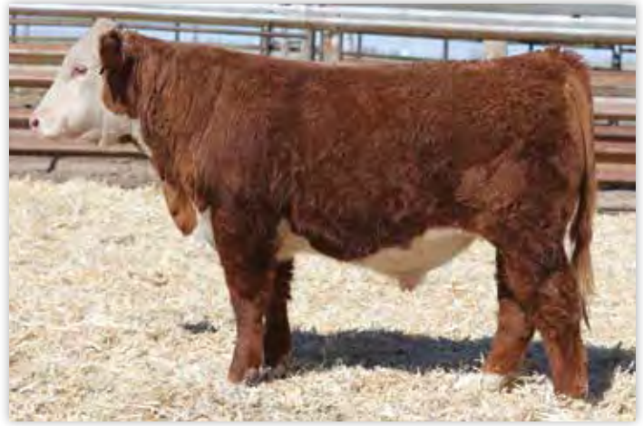
LOT 26 - JCS 7314 COOPER 0776