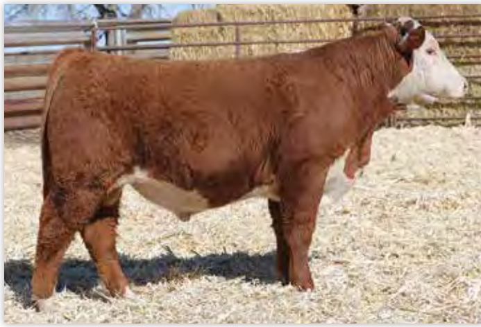
LOT 29 - JCS 7314 COPPER 0785