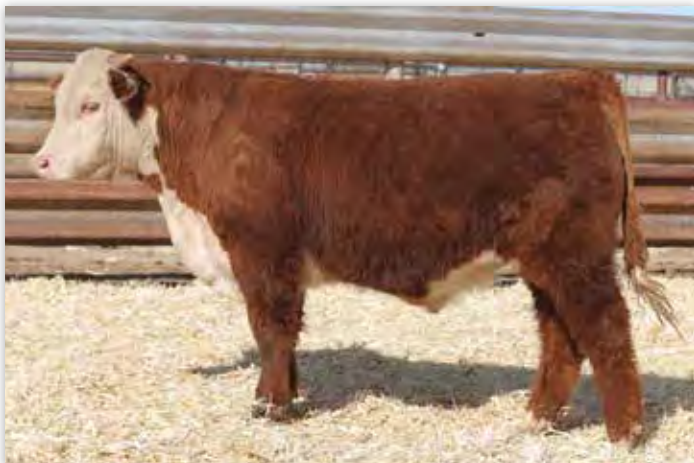
LOT 35 - JCS FULL FORM 0821