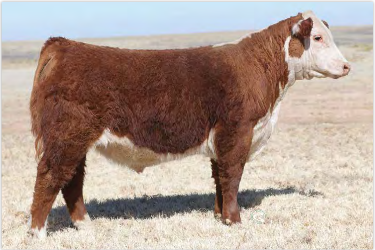
LOT 7 - JCS SPARTAN 0752