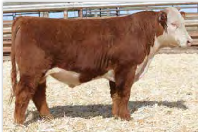
LOT 4 - JCS 240 DOMINO 0711