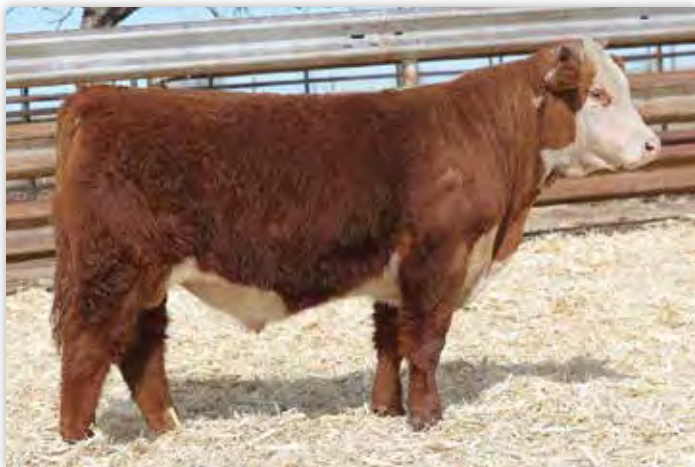
LOT 11 - JC AC HOMEBREW 0731