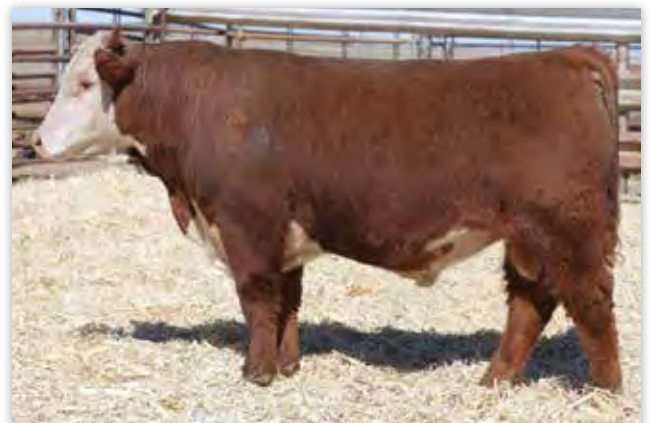
LOT 39 - JCS 8341 DOMINO 0710