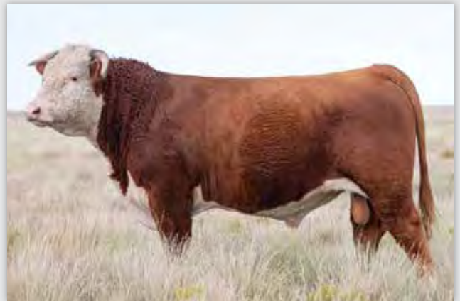
JCS 124Y COPPER 7314 - REFERENCE SIRE H