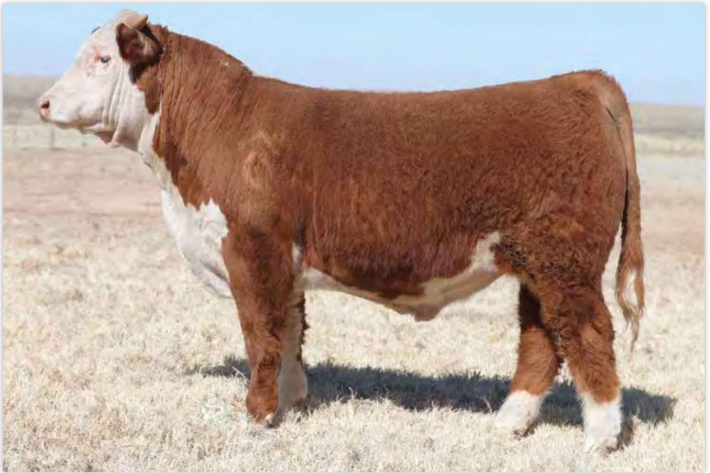
LOT 13 - JCS HOMEBREW 0737