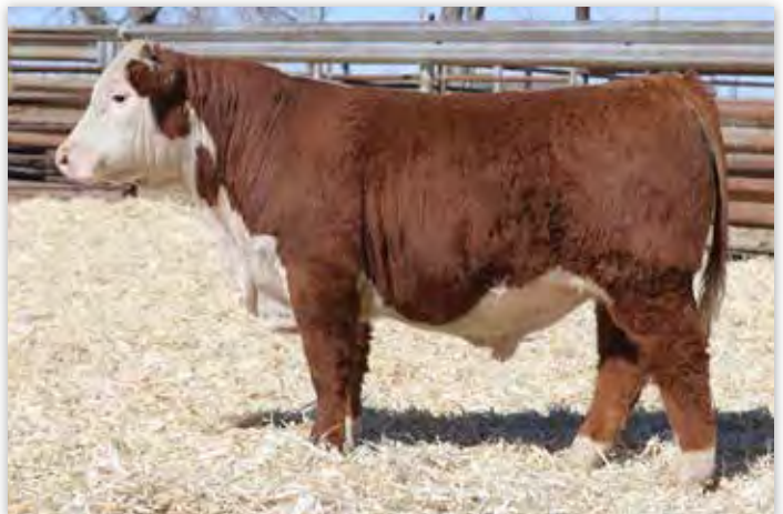
LOT 48 - JCS ROYAL BLEND 0798