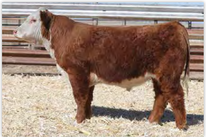
LOT 47 - JCS RED POWER 0709