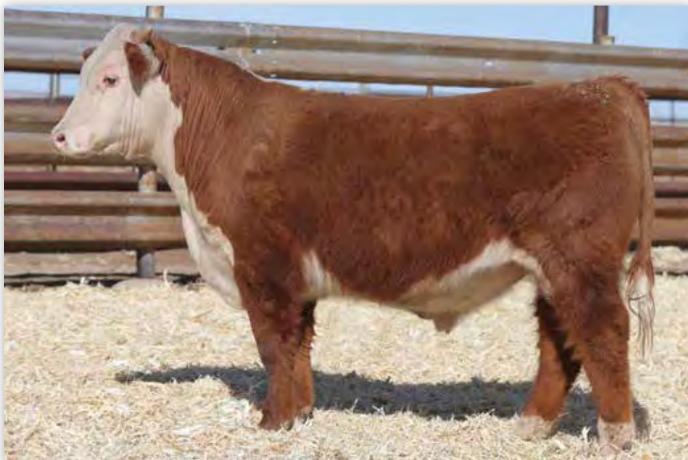
LOT 41 - JCS 8422 DOMINO 0815