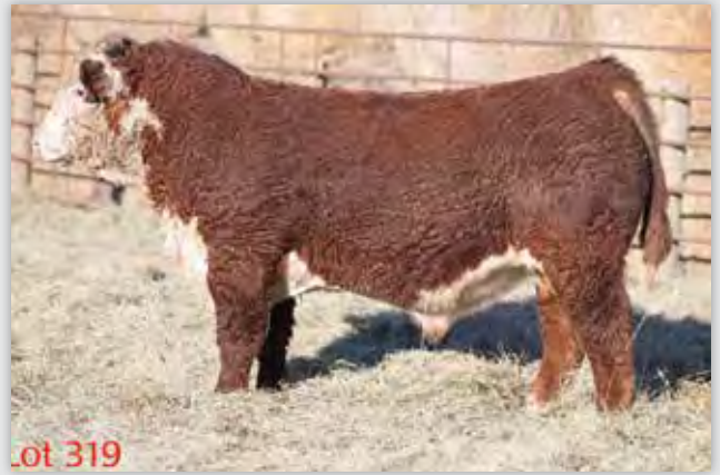
UPS 3310 SPARTAN 60008 - REFERENCE SIRE E