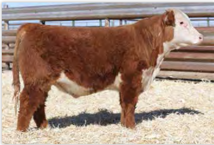
LOT 10 - JCS HOMWBREW 0762