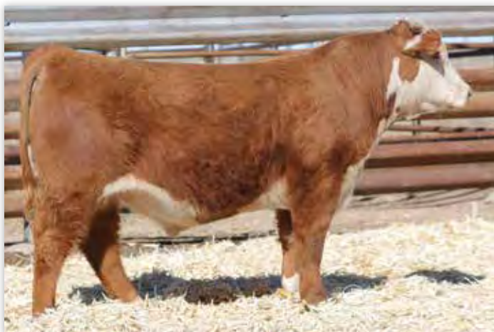
LOT 31 - JCS 7314 COPPER 0789