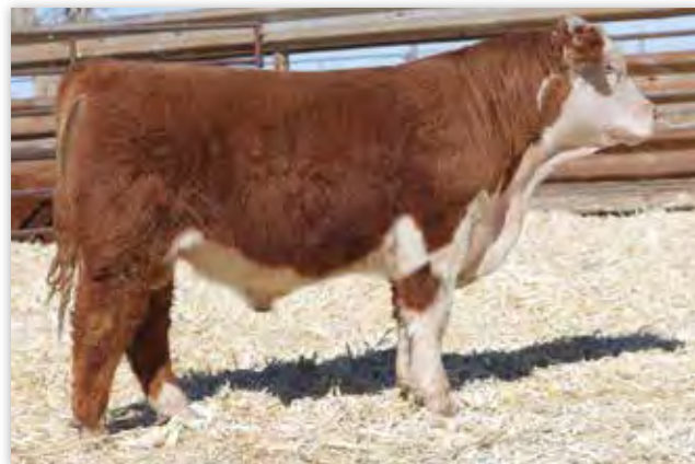
LOT 8 - JCS SPARTAN 0790