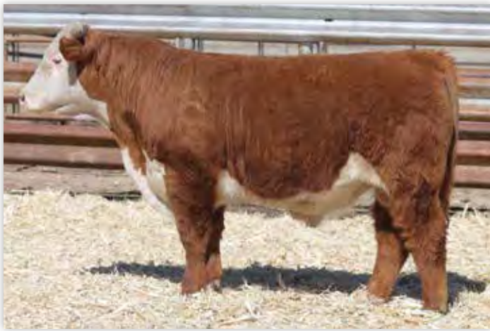
LOT 34 - JCS FULL FORM 0816