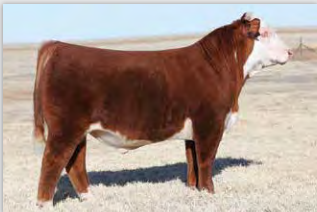
JCS AC LIMITED EDITION 8442 - REFERENCE SIRE I