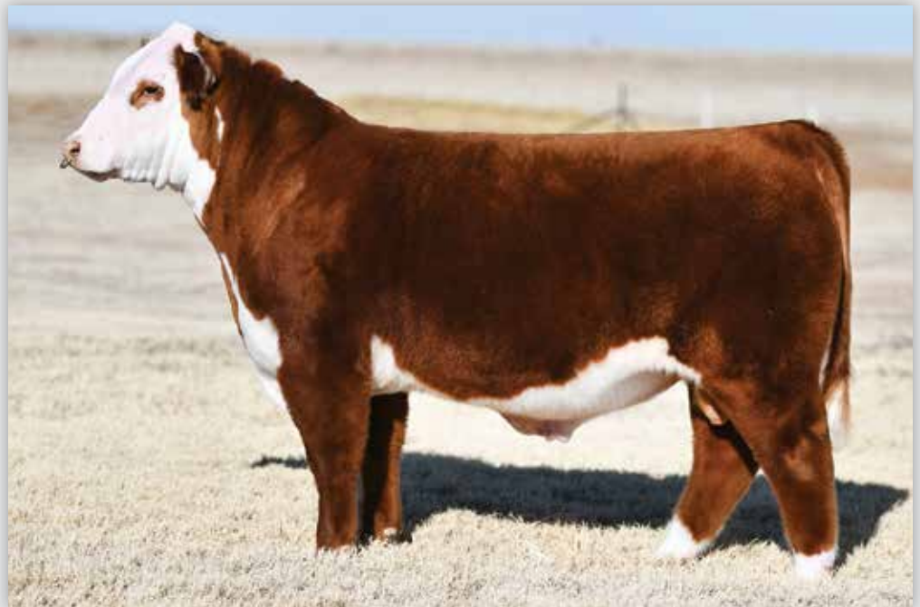
GREEN JCS MAKERS MARK 229G ET - REFERENCE SIRE K