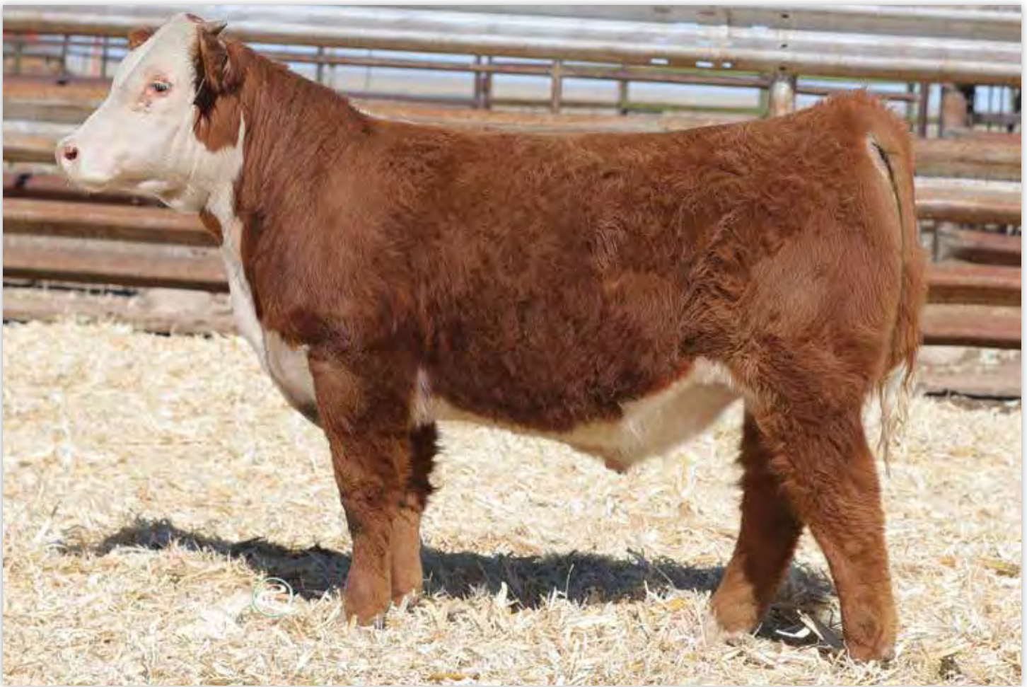
LOT 32 - JCS 7314 COPPER 0857