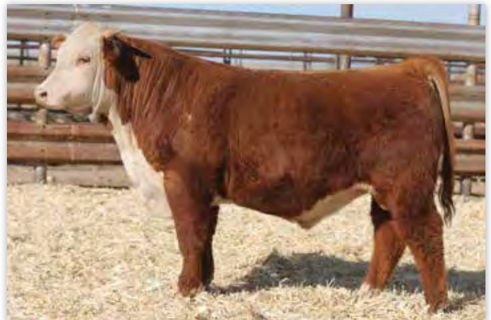
LOT 27 - JCS 7314 COPPER 0792