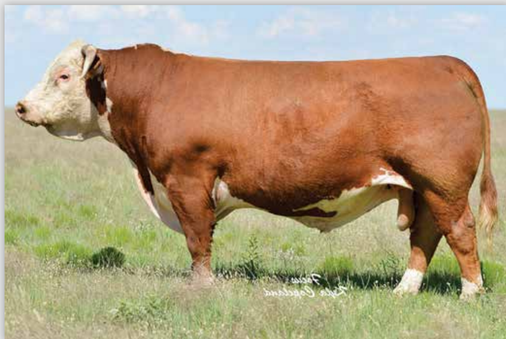
BR COOPER 124Y - REFERENCE SIRE L