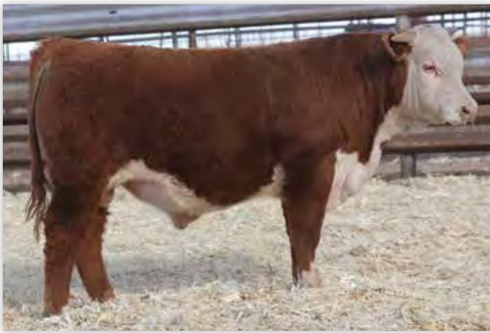
LOT 23 - JCS 7314 COPPER 0756