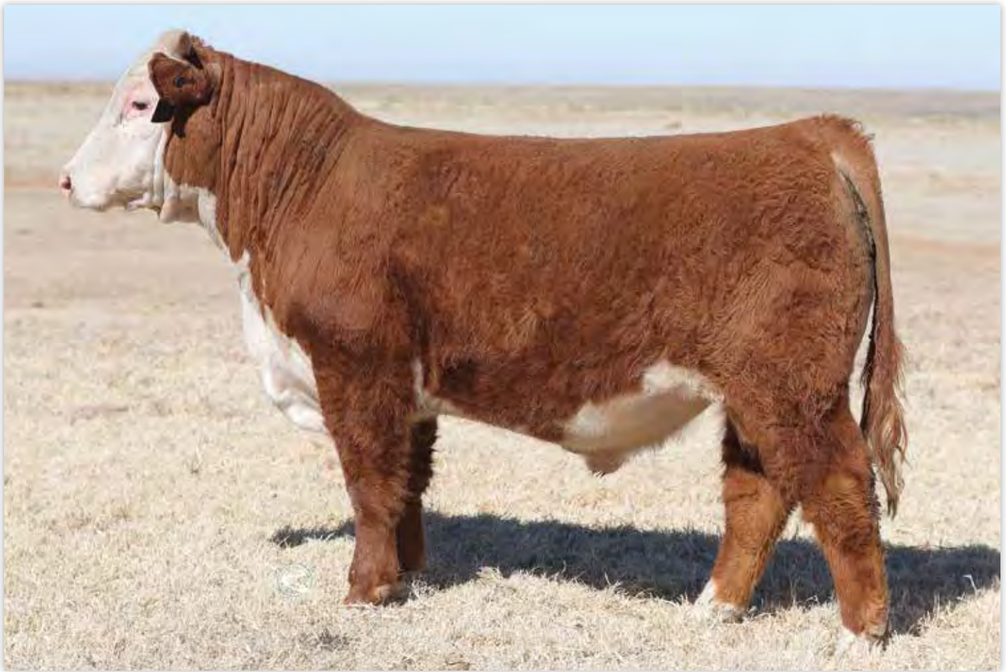
LOT 38 - JCS 8341 DOMINO 0700