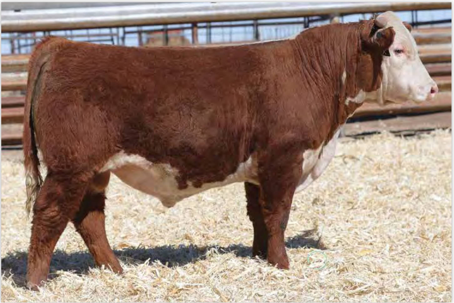
LOT 37 - MAT 1321 DOMINO 0705