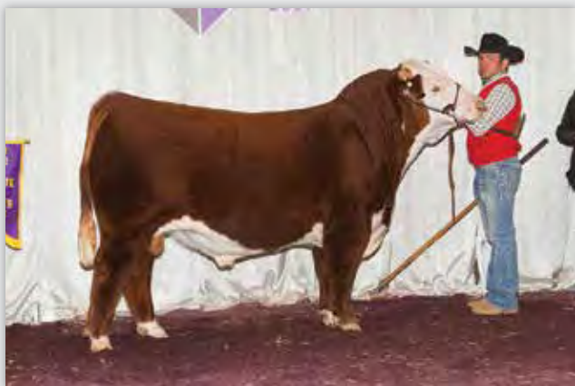
JCS HONDO 9612 - REFERENCE SIRE J