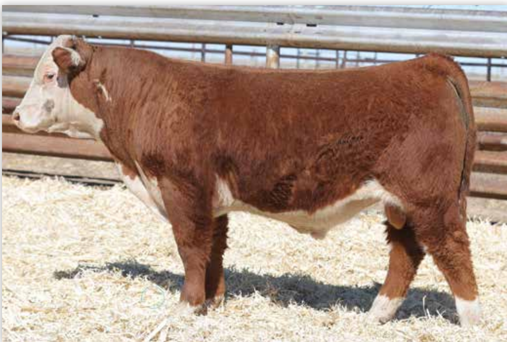
LOT 42 - JCS 8442 DOMINO 0777