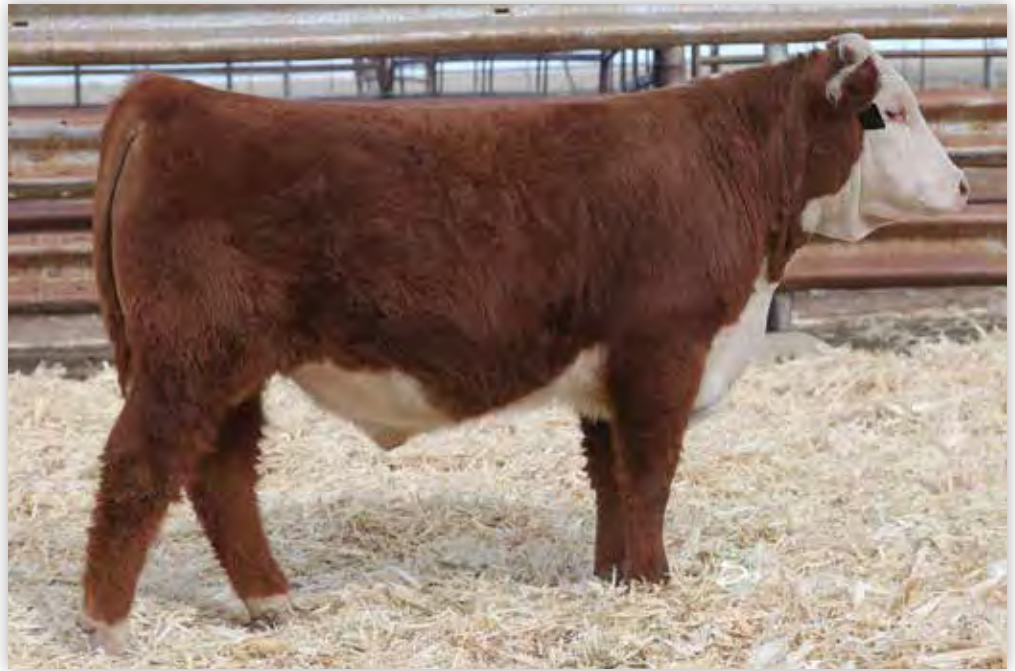
LOT 14 - JCD HOMEBREW 0744