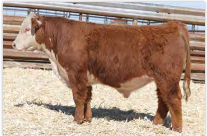
LOT 22 - JCS ENCHANTMENT 0833