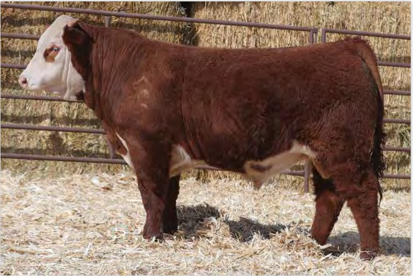
LOT 9 - JCS HOMEBREW 0761