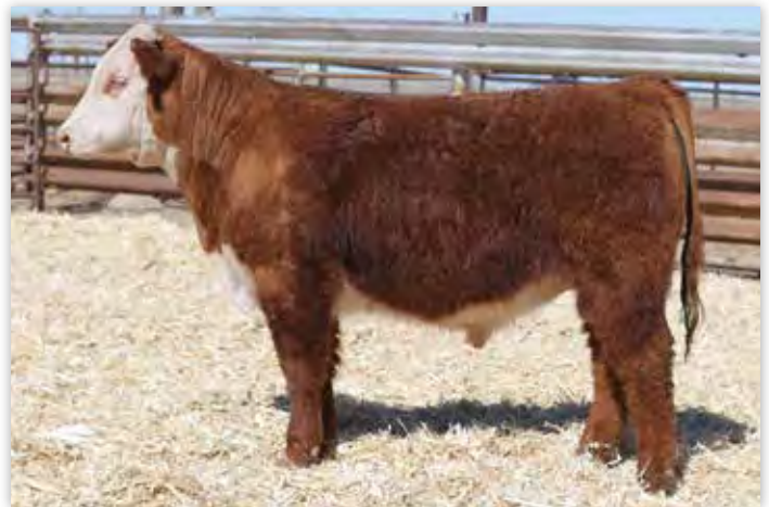
LOT 21 - JCS ENCHANTMENT 0858