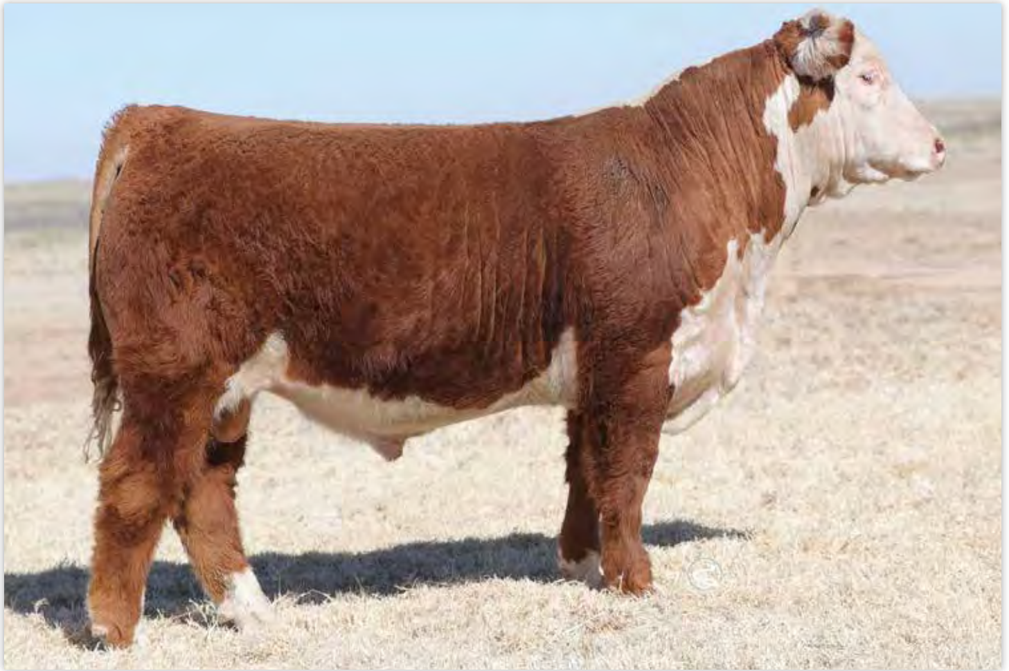
LOT 3 - JCS DOMINO 0886 ET