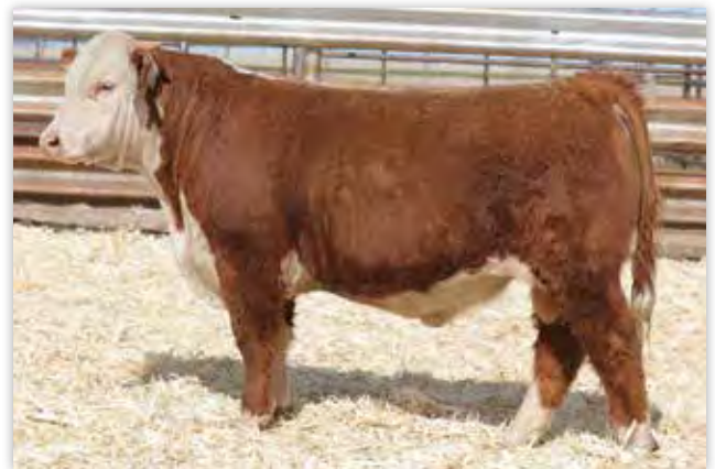
LOT 6 - JCS 5847 DOMINO 0888 ET