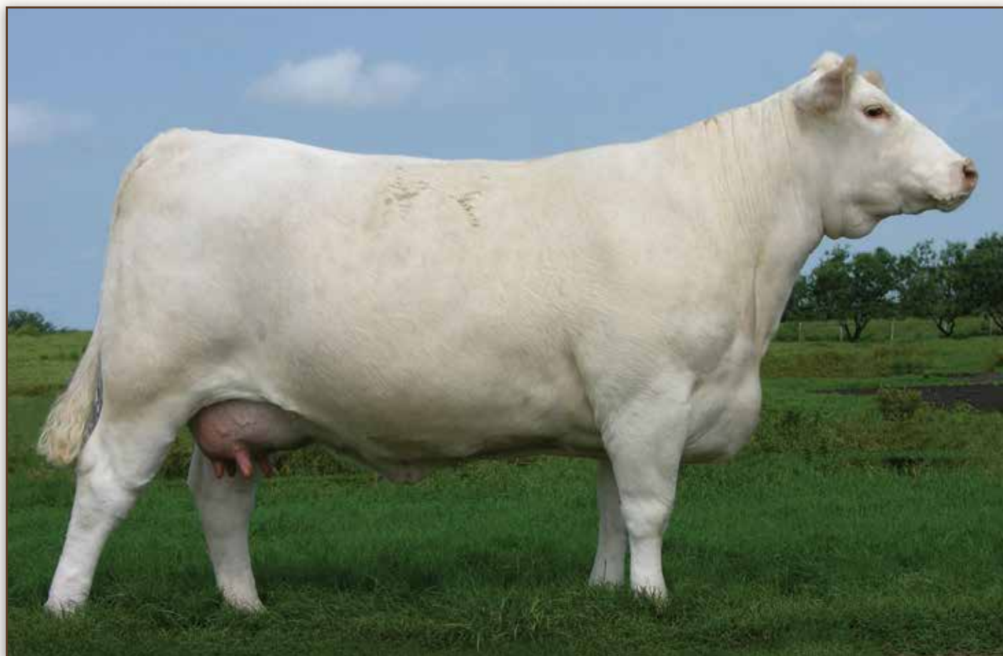
MT DORA 5617 IS THE DAM OF LOTS 12, 13, 14, 25 & 86