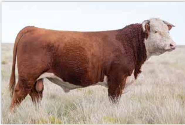
JCS 124Y COPPER 7314 - REFERENCE SIRE E