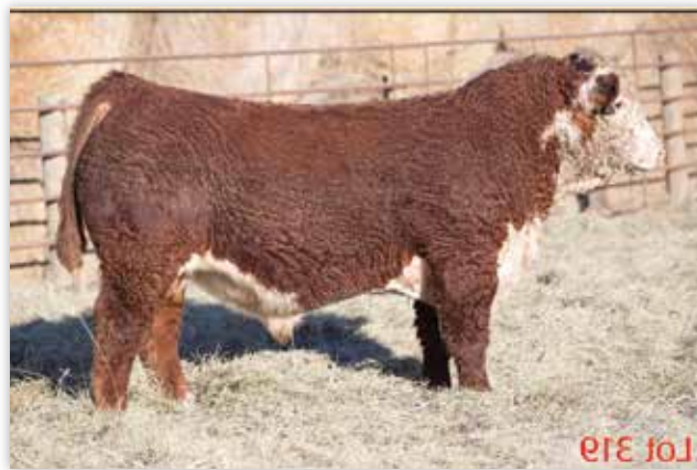
UPS 3310 SPARTAN 60008 - REFERENCE SIRE C