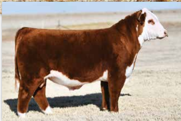
GREENS JCS MAKERS MARK 229G ET - SIRE

• 1153 is a powerfully designed individual with tremendous depth and style. He is dark red in color with added pigment, bone, hip and is so fluid when put into motion. His dam is a direct daughter of 7902, the full sister to Gabrielle 5082 the now deceased immortal donor for Barber Ranch. He is an elite individual with an elite pedigree.