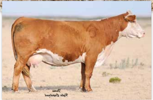
JCS MISS ROYALTY 4720 - MATERNAL GRANDDAM