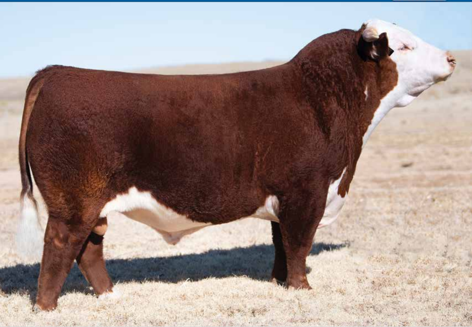
JCS HONDO 9612 - REFERENCE SIRE I