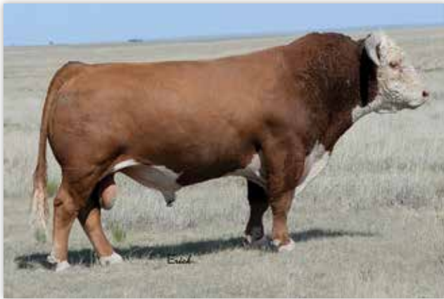
BAR S LHF 028 240 - REFERENCE SIRE F