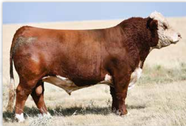
JCS ROYAL BLEND 7210 ET - REFERENCE SIRE D