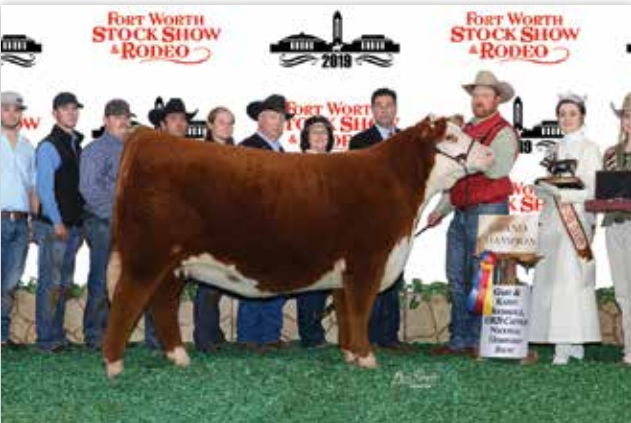
JCS MISS BUTTERCUP 7296 - FULL SIB TO GUNSMOKE 9580