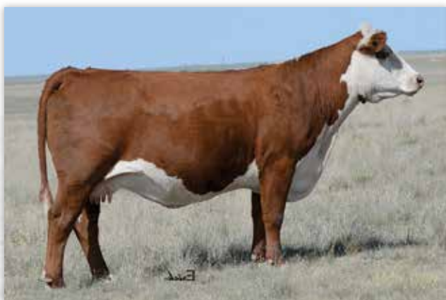
DF 18U BRITTANY 907 1405 ET - DAM OF LOT 3