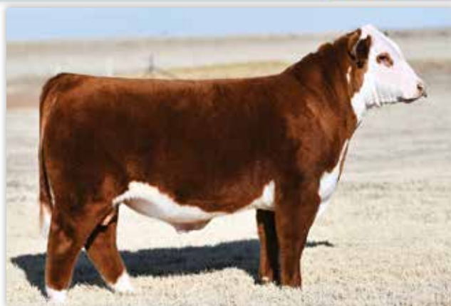
GREENS JCS MAKERS MARK 229G ET - REFERENCE SIRE A