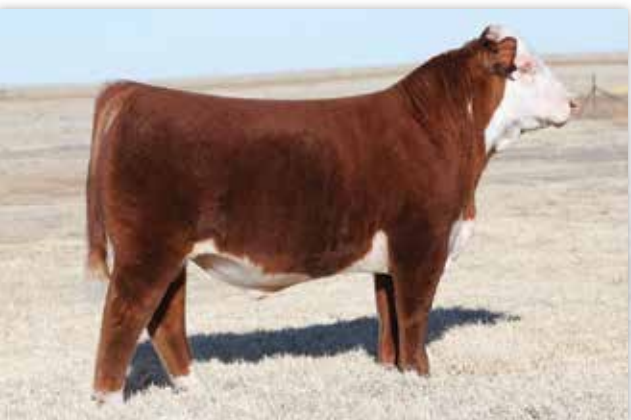
JCS AC LIMITED EDITION 8442 - REFERENCE SIRE H