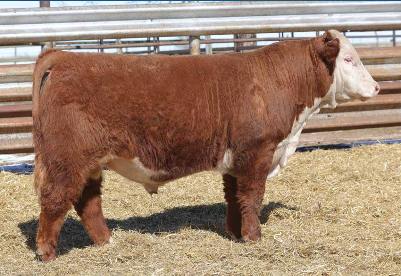
JCS 1321 MARK DOMINO 8341