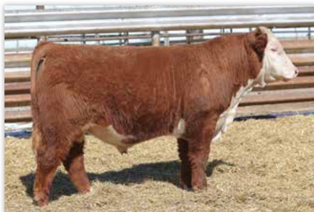
JCS 1321 MARK DOMINO 8341 - REFERENCE SIRE B