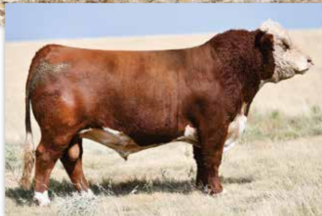
JCS ROYAL BLEND 7210 ET - SIRE OF LOT 17